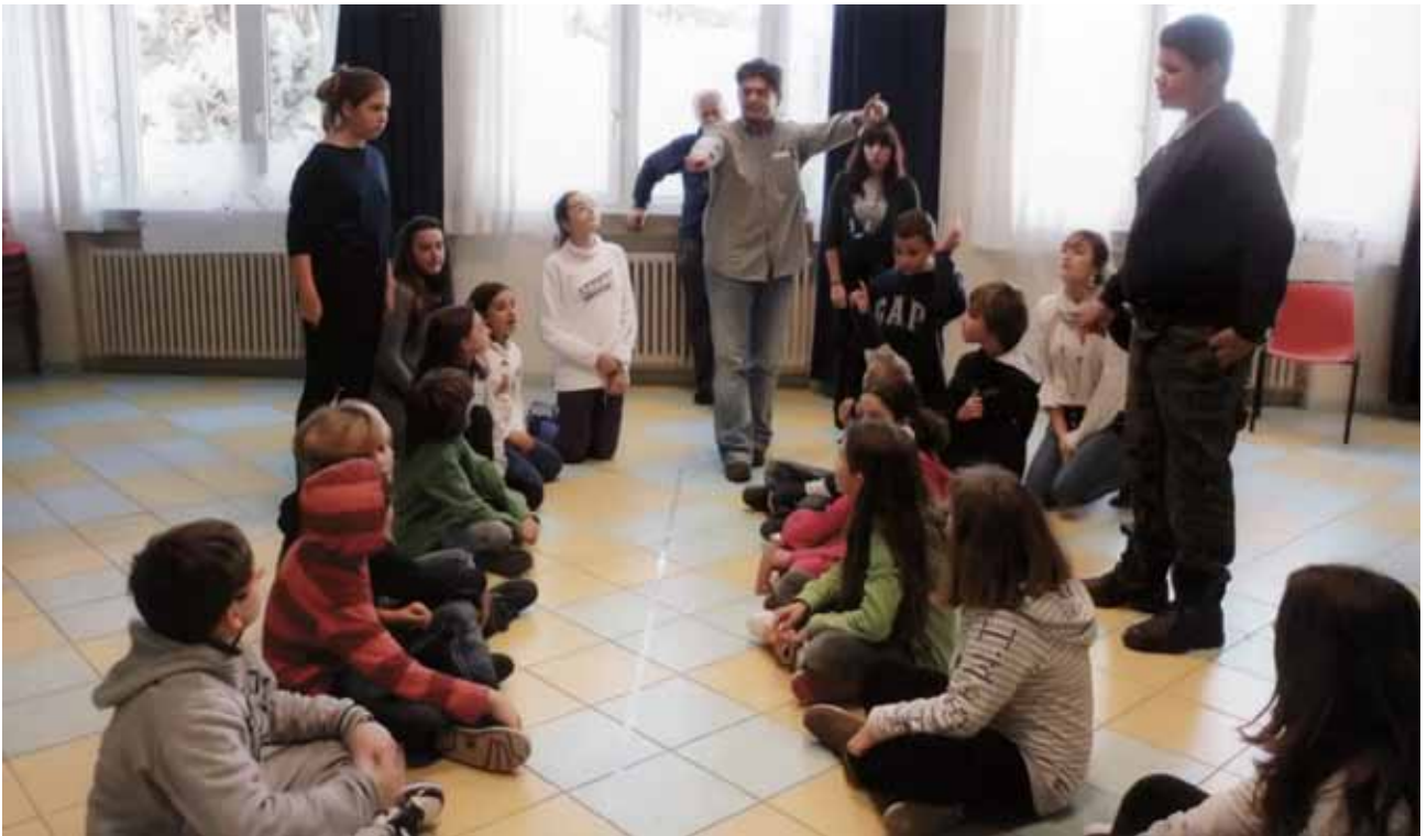
EMA students' workshops in Venice-Lido Elementary School, 2011/2012