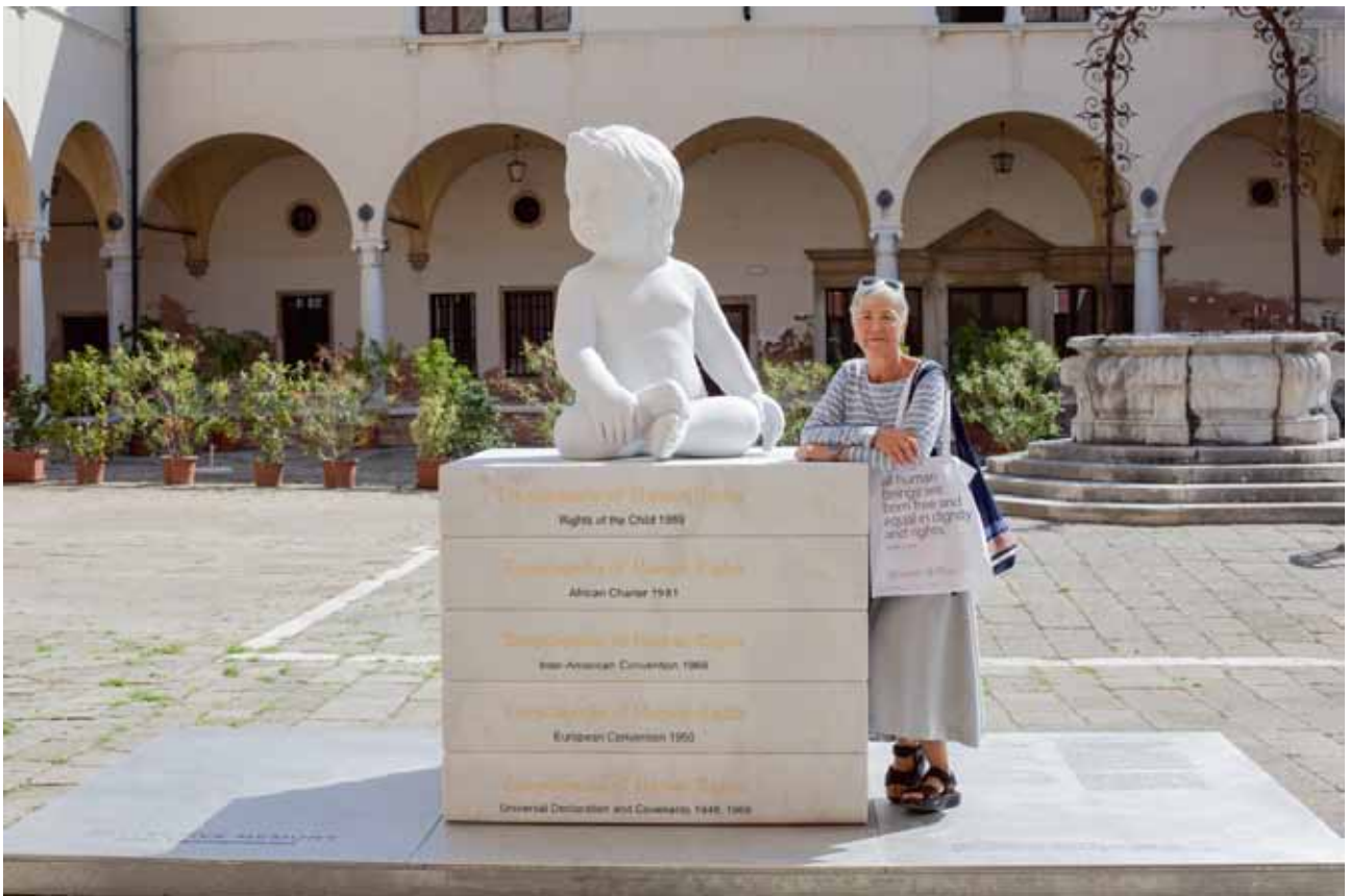
Italian Actress Ottavia Piccolo in the Cloister of the Monastery of San Nicolò with art installation "Collective Memory", during the Summer School on Cinema, Human Rights & Advocacy (2017)