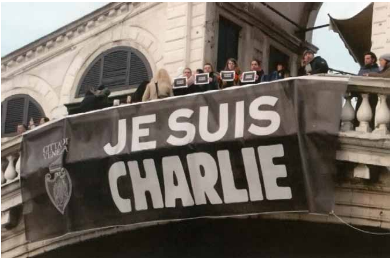
EMA students – “Je Suis Charlie” campaign at Rialto Bridge, Venice, 2015