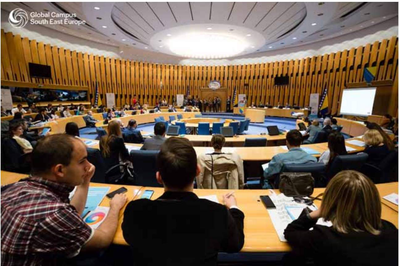
ERMA students – Global Campus Conference, Sarajevo 2017