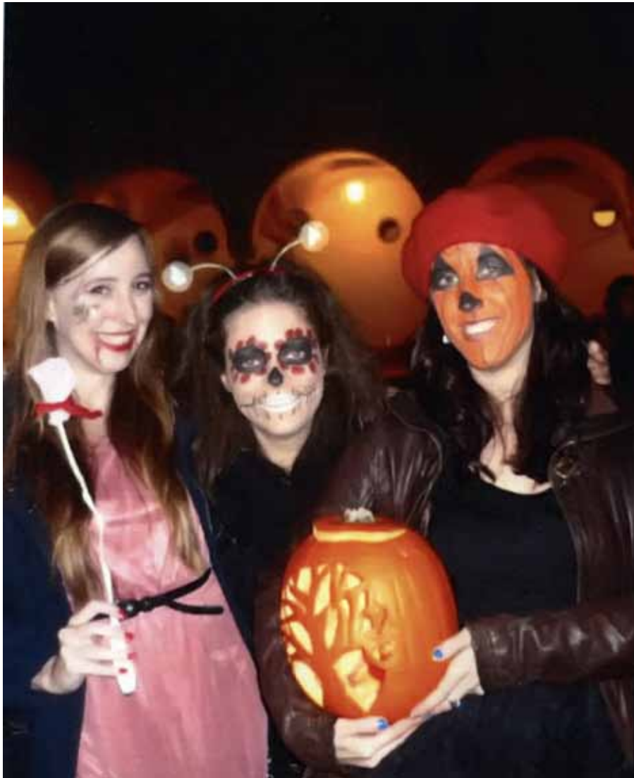
EMA Students at Halloween Party, 2013/2014