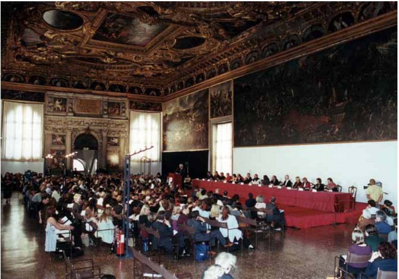
Sergio Mattarella addressing the EMA Ceremony when Minister of Defence – Venice – Palazzo Ducale, Sala dello Scrutinio (2000)