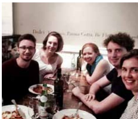
Global Campus Alumni meeting

In 2015 we embarked on a new and exciting period of the E.MA Alumni and formally joined together with our sister associations from other regions to create the Global Campus Alumni (GCA). This built on an initial meeting and discussions which started in Venice two years earlier. It was a challenge to work virtually, link projects across different regions and set up a whole new association in Belgium. But also incredibly rewarding: despite studying in disparate locations there is a strong bond that we all share through our common belief and passion for the human rights movement. With spaces for civic activism diminishing, now more than ever, we need to maximise our potential and build strong and dynamic connections. It's been a stimulating period and we look forward to continued GCA action!