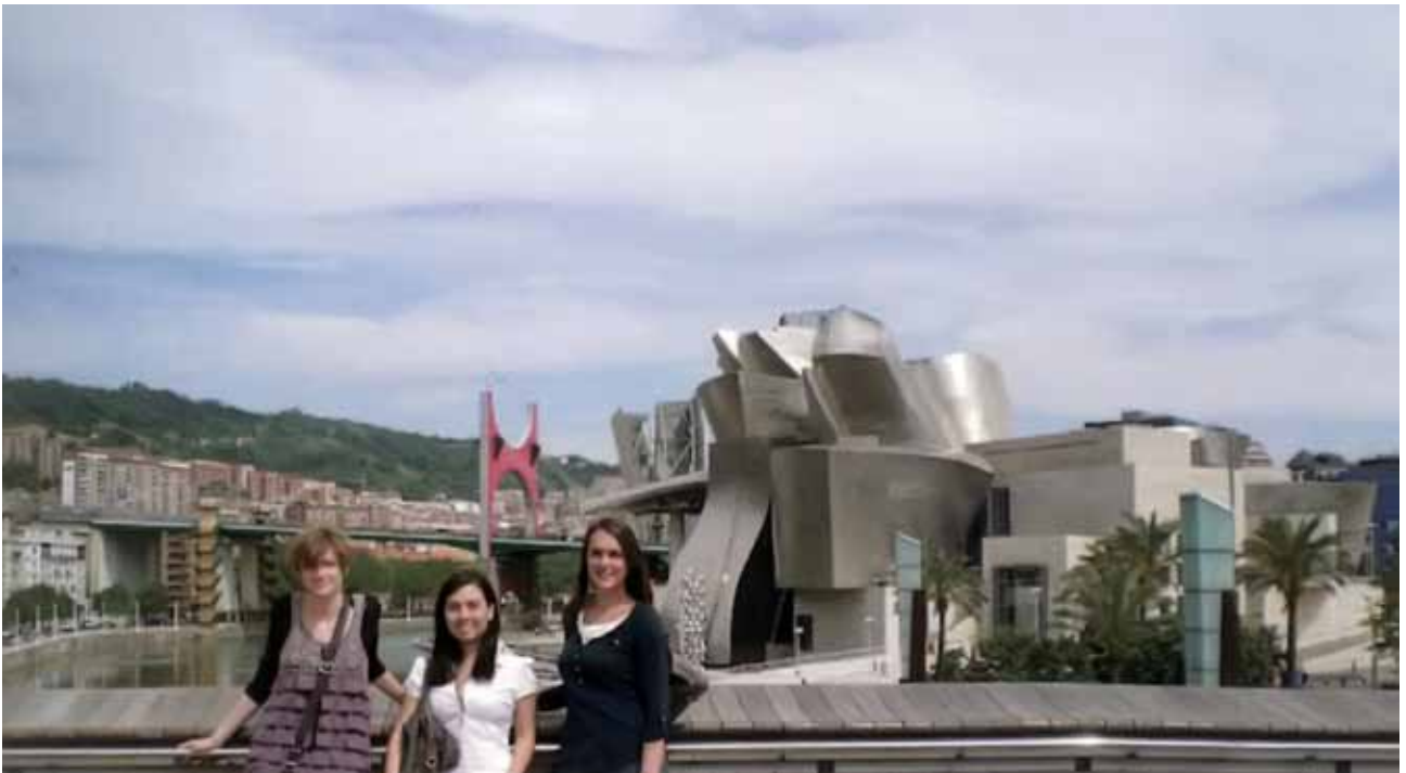
EMA Students at the University of Deusto, Bilbao