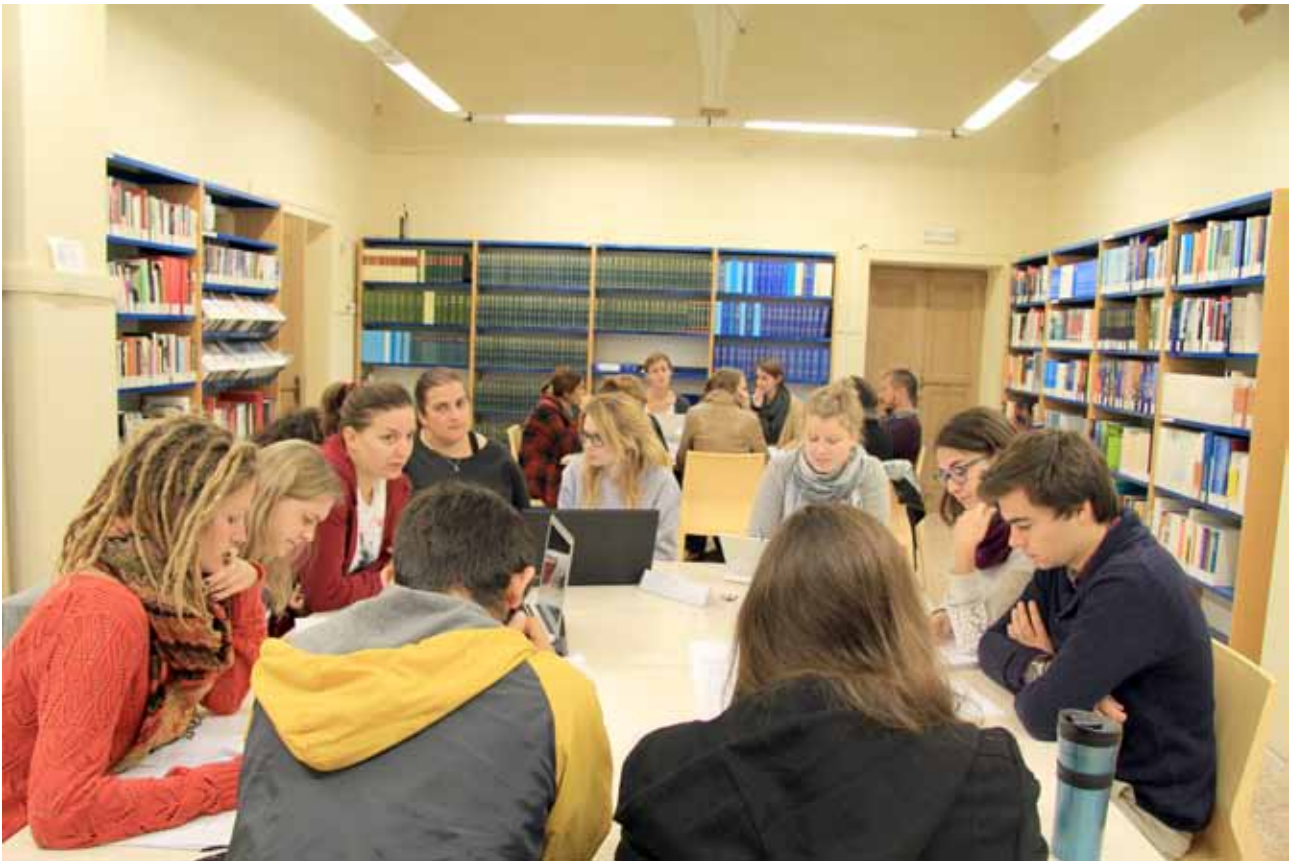
Workshop of EMA students, 2012/2013