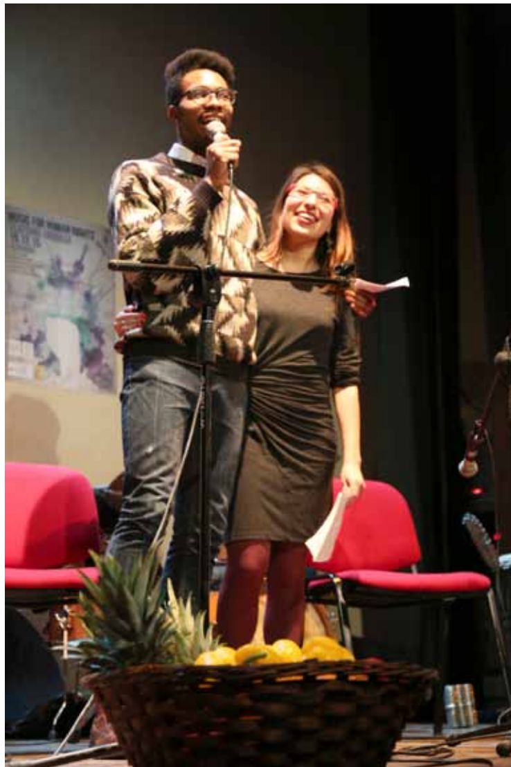
EMA Music Festival 2015/2016, Teatrino di Villa Groggia, Venice