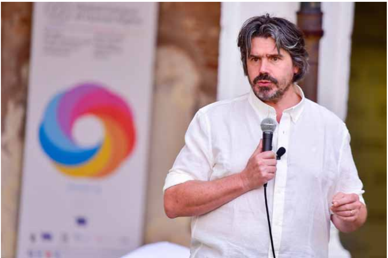
Koen Vanmechelen, artist creator of “Collective Memory” during the Opening Cocktail of the Venice School 2017