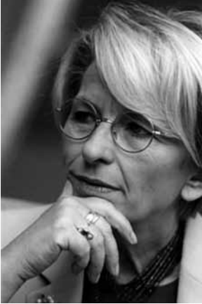
Emma Bonino, former Italian Minister of Foreign Affairs (2013-2014), and European Commissioner (1994-1999)

Attacks on democracy are not new: since time immemorial, democracy has been undermined and ignored by those seeking absolute power. However, defence of democratic values and human rights principles has never been more important, in a time when authoritarianism and human rights denial are again on the rise. It is critical for the next generation of women and men who will hold power, and for those holding our world's leaders to account, to have well-grounded knowledge about the importance of democracy and human rights for the well-being of all, the tools to combat erosion of those principles and the wisdom to wield those tools with strength and compassion. Programmes like EMA have played a fundamental role in this struggle for 20 years, and we look forward to them growing and increasing their impact in the years and decades to come.