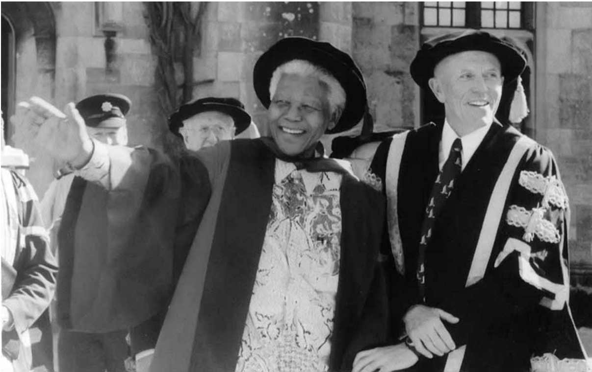
Nelson Mandela, Honorary Doctorate of Laws, National University of Ireland, Galway, 20 June 2003