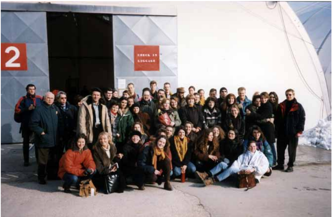
EMA students, field trip to Bosnia and Herzegovina, 1998