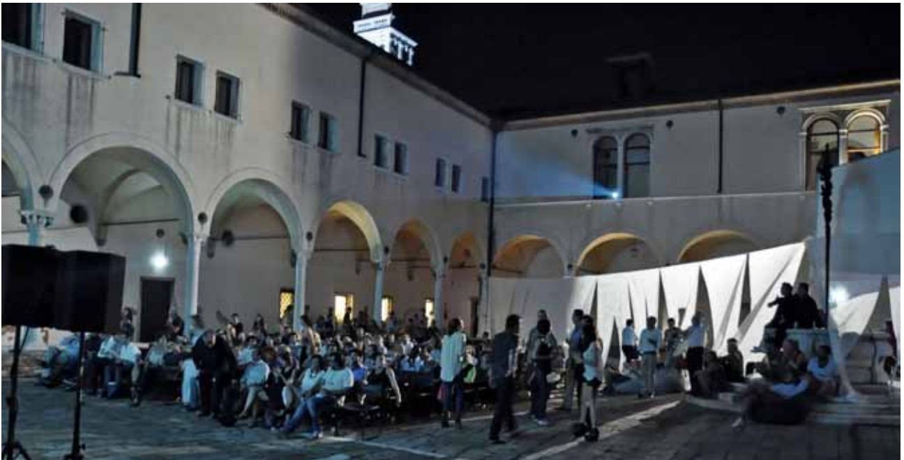
Circuito OFF – short film Festival at the Monastery of San Nicolò, Venice-Lido