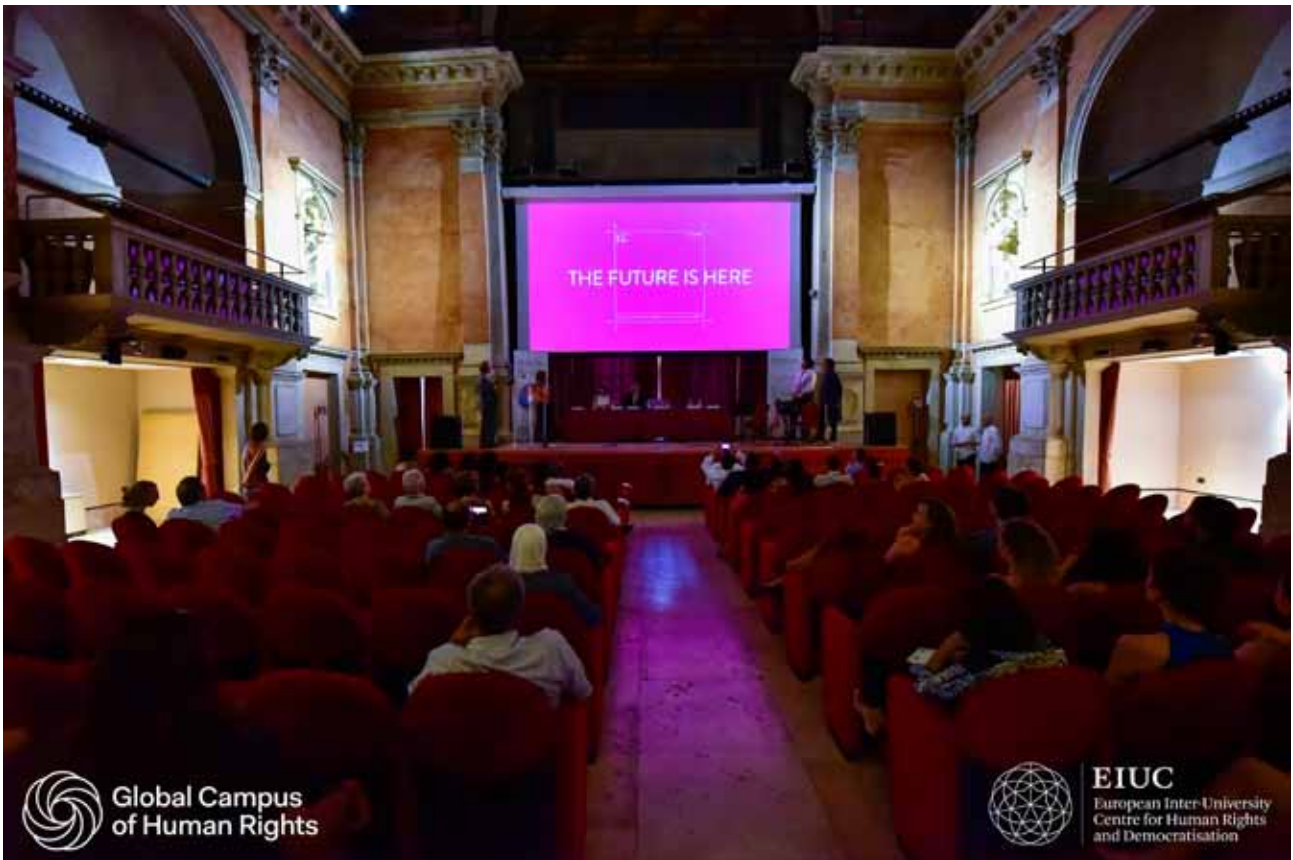
ARMA Programme – Graduation Ceremony 2016/2017, Auditorium Santa Margherita: “The future is here”