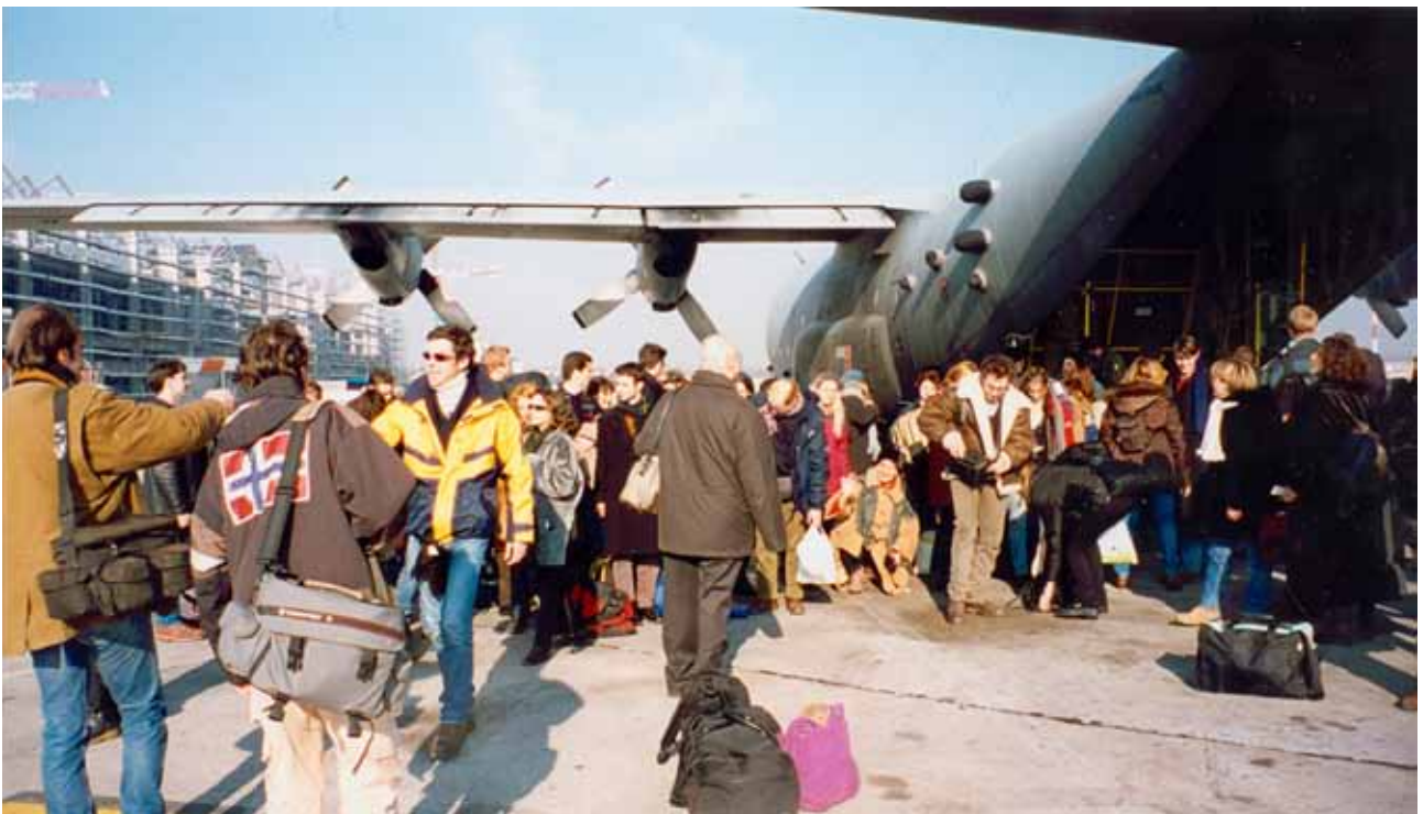
EMA students, field trip to Bosnia and Herzegovina, 1998