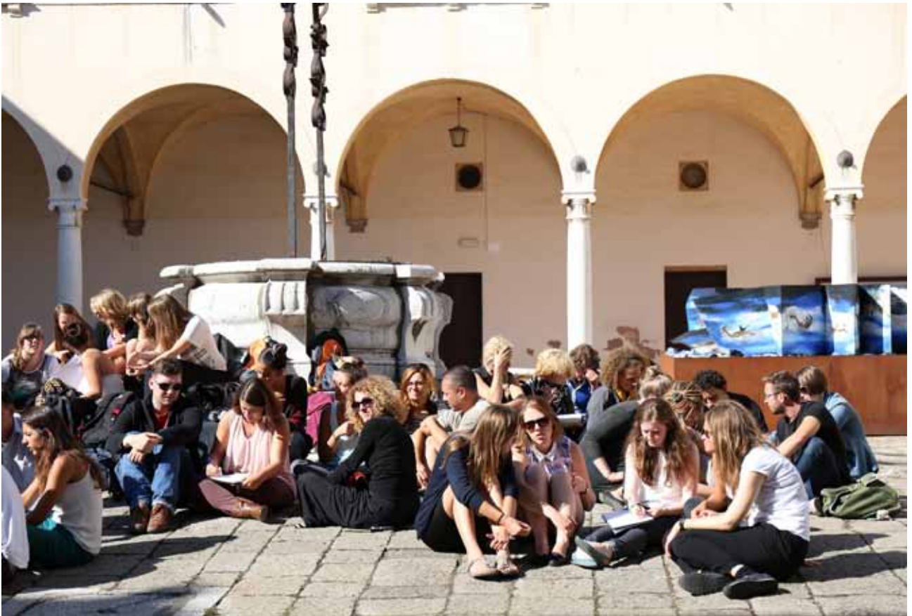
EMA students' sit-in in the cloister, 2015/2016