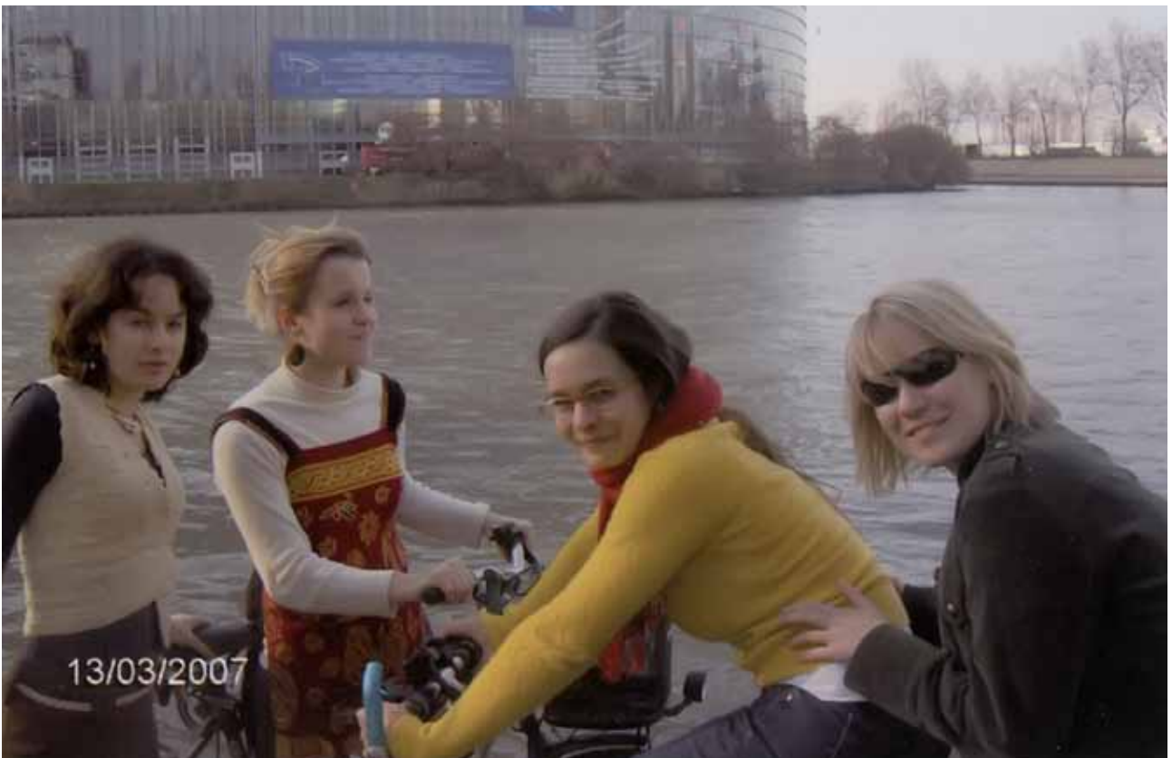
EMA students delegation at the University of Strasbourg 2006/2007 – visit to the European Parliament