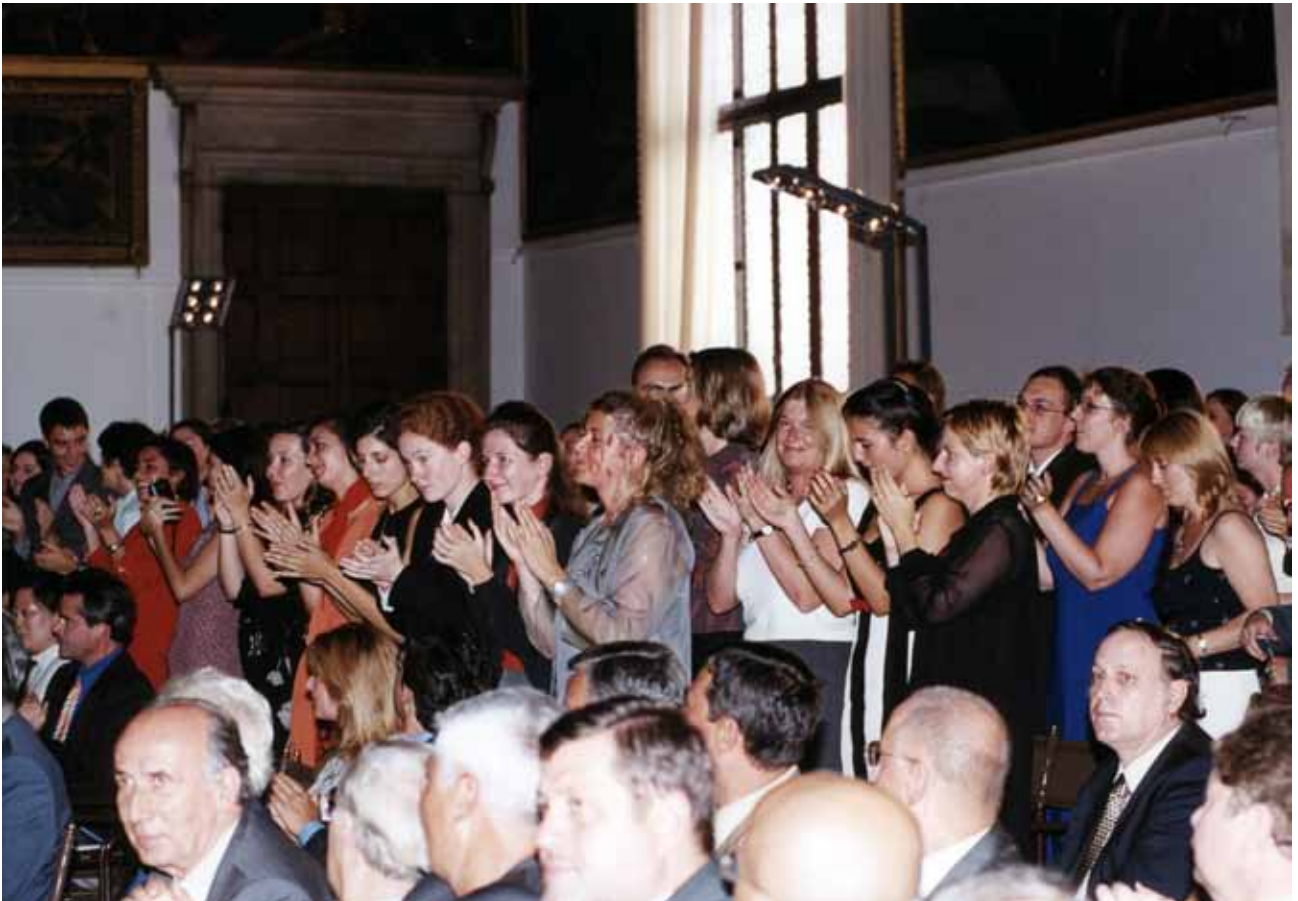
EMA graduates 1999/2000 – Venice – Palazzo Ducale