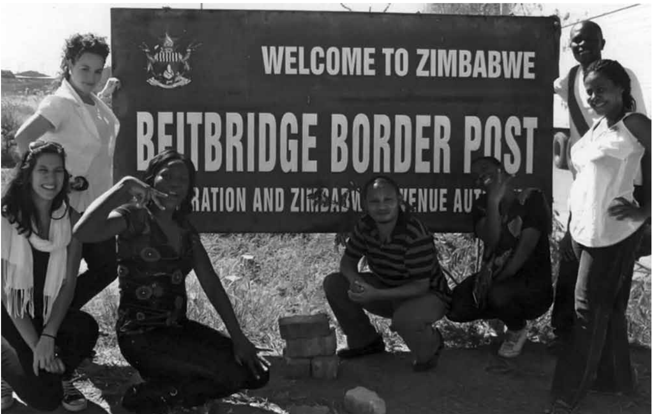
HRDA Programme – Field Trip to Zimbabwe (EMA and HRDA students' exchange)