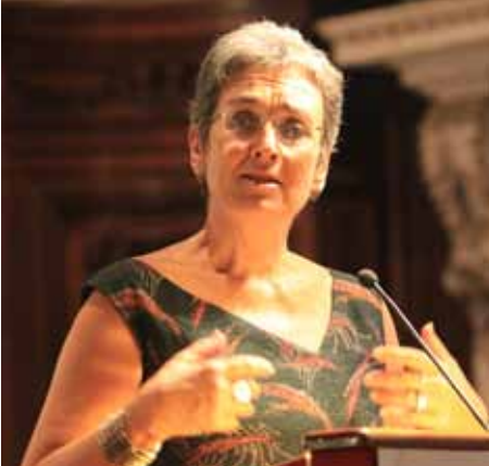
Ulrike Lunacek MEP, Vice-President of the European Parliament at the EMA Graduation Ceremony 2016

Congratulations! Twenty years of EMA is a success story with worldwide positive repercussions on human rights and democracy. You provide education and training on this important topic. And EMA alumni and graduates constitute a strong resource base, highly in demand for the promotion and protection of human rights and democracy at global, continental, national and regional as well as local levels. Human and Fundamental Rights are at the core of the European Union (EU), and the European Parliament is the most outspoken of the three EU institutions in their promotion and defence – inside of the EU as well as in third countries. I am convinced that together we can empower and support all those who struggle to live a life free from fear, repression or torture, to achieve respect and dignity for all.