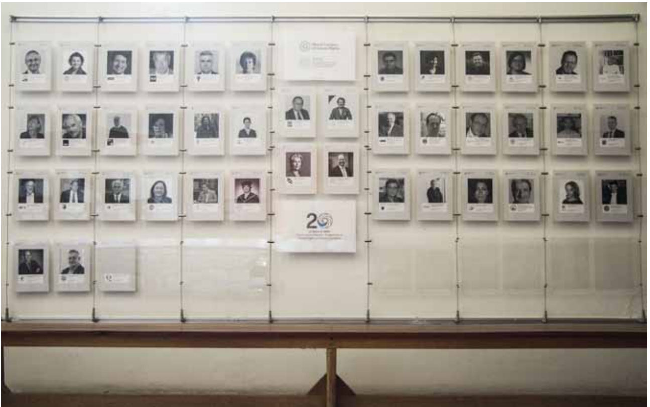
EMA Professors' photo gallery – Monastery of San Nicolò, Venice-Lido