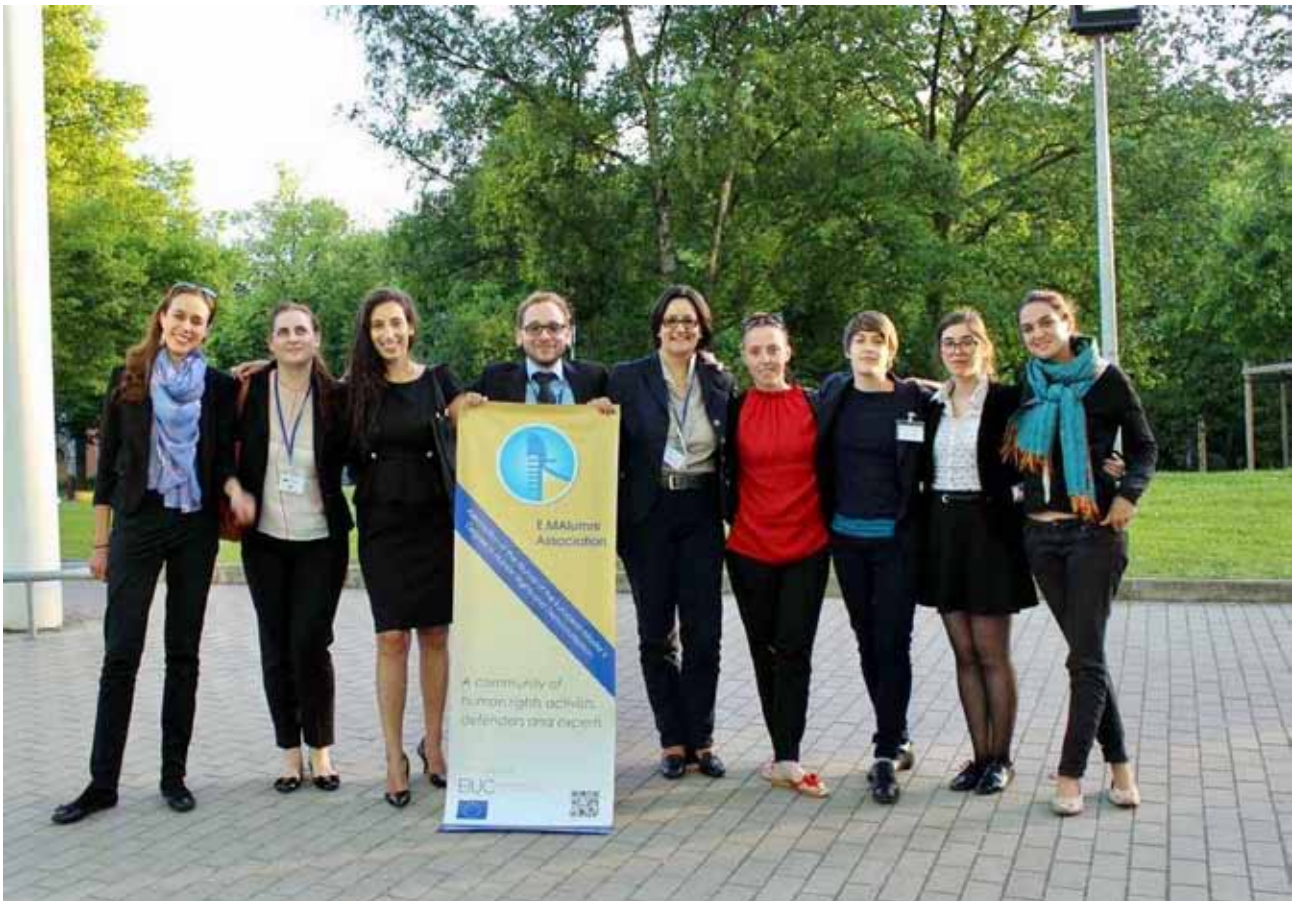
EMA Alumni Association – Board members, 2012-2014