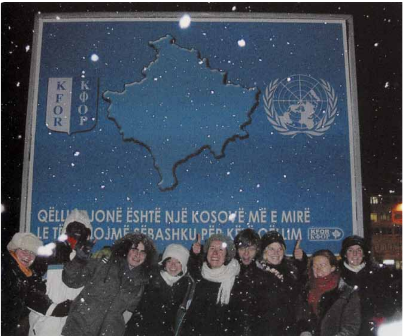
EMA Field Trip to Kosovo, 2004/2005 – in the snow