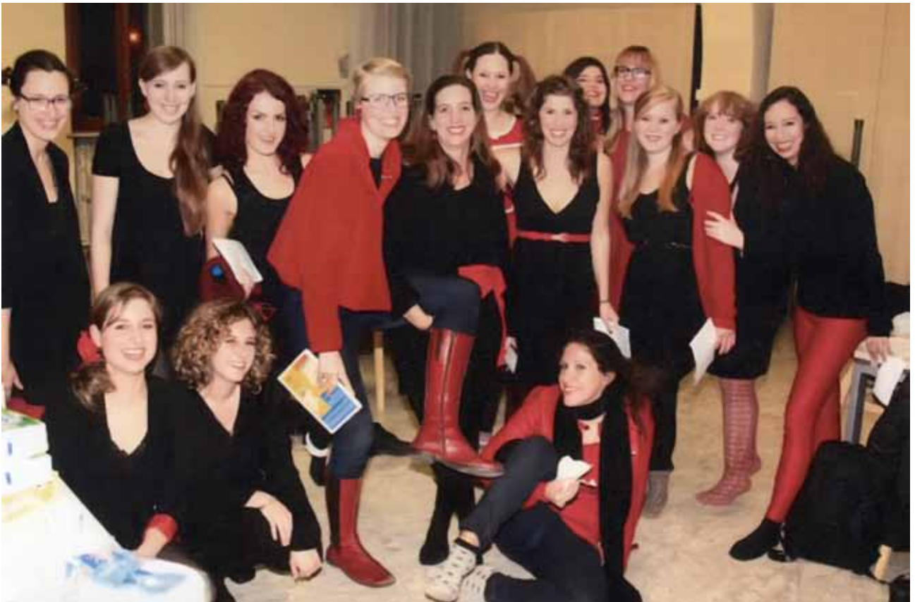
EMA theatre company "Vagina Monologues" 2013/2014