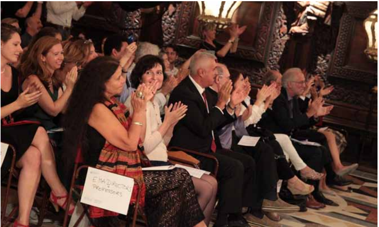
EMA professors and Alumni – EMA Graduation Ceremony 2015/2016, Venice – Scuola Grande di San Rocco