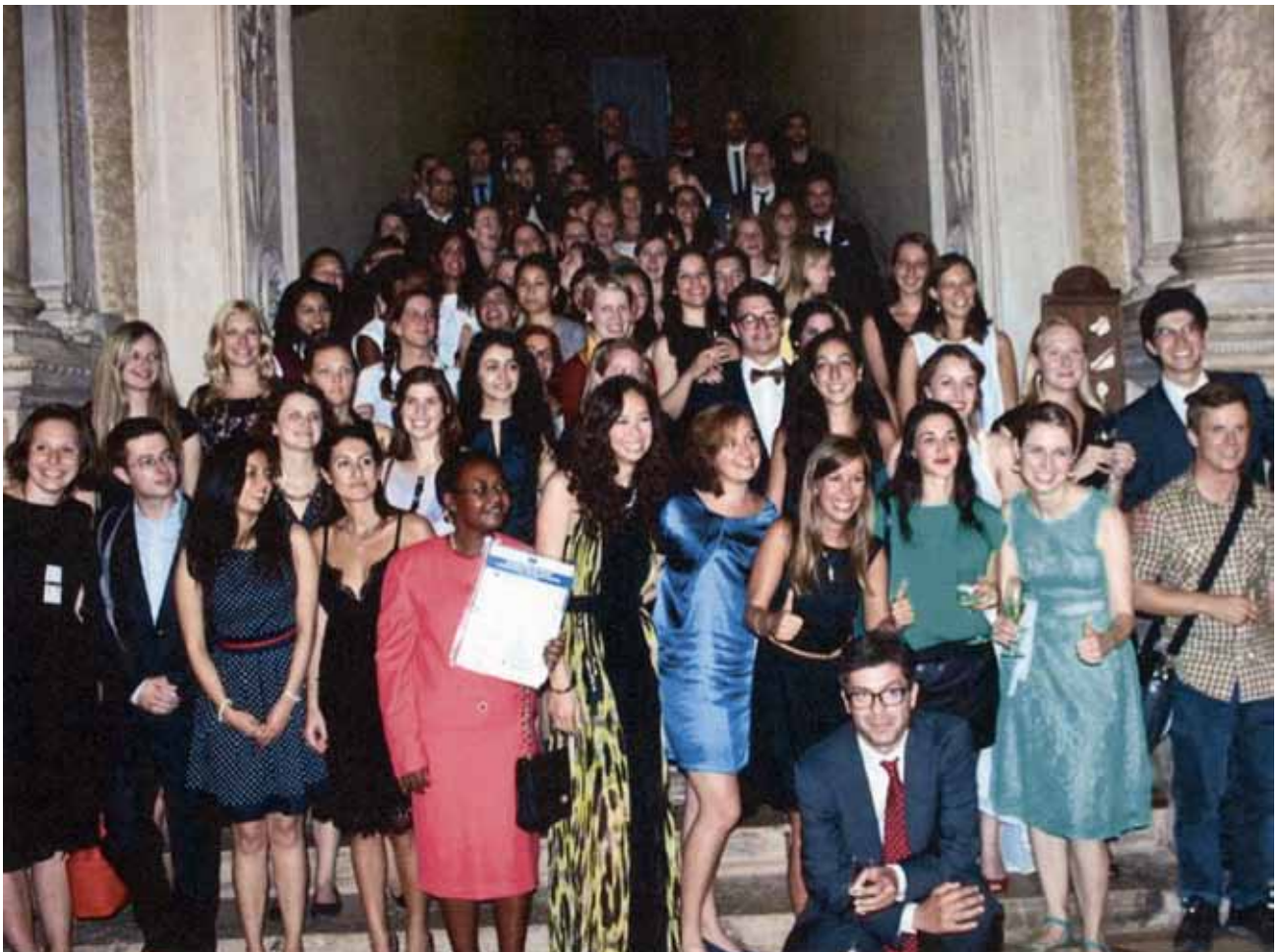
EMA Graduation Ceremony 2013/2014, Venice – Scuola Grande di San Rocco: group photo