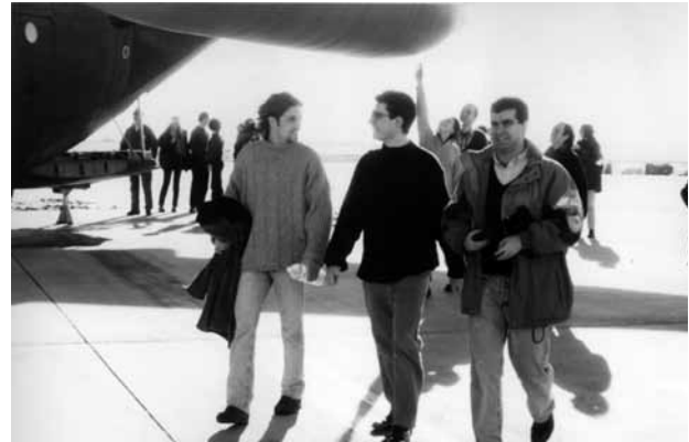
EMA field trip to Bosnia and Herzegovina, 1998/1999

mours of forced labour camps increased, so also did the hopes of many women who dared to wish that their fathers, husbands and sons would be found labouring but alive in the mines of Serbia and Kosovo. Students were confronted with all of these incredible first-hand accounts, which painted a complex picture of a region still in turmoil.