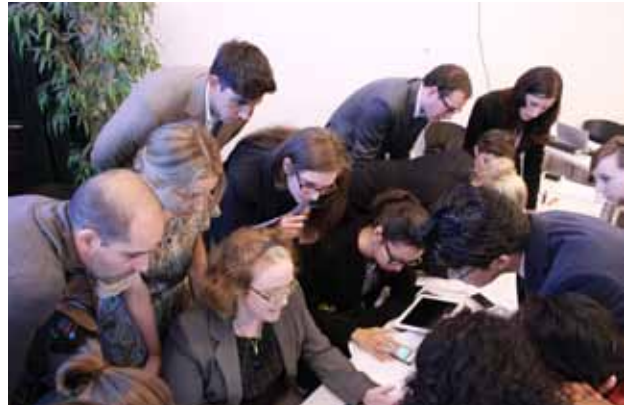
EMA Moot Court negotiations, 2014/2015