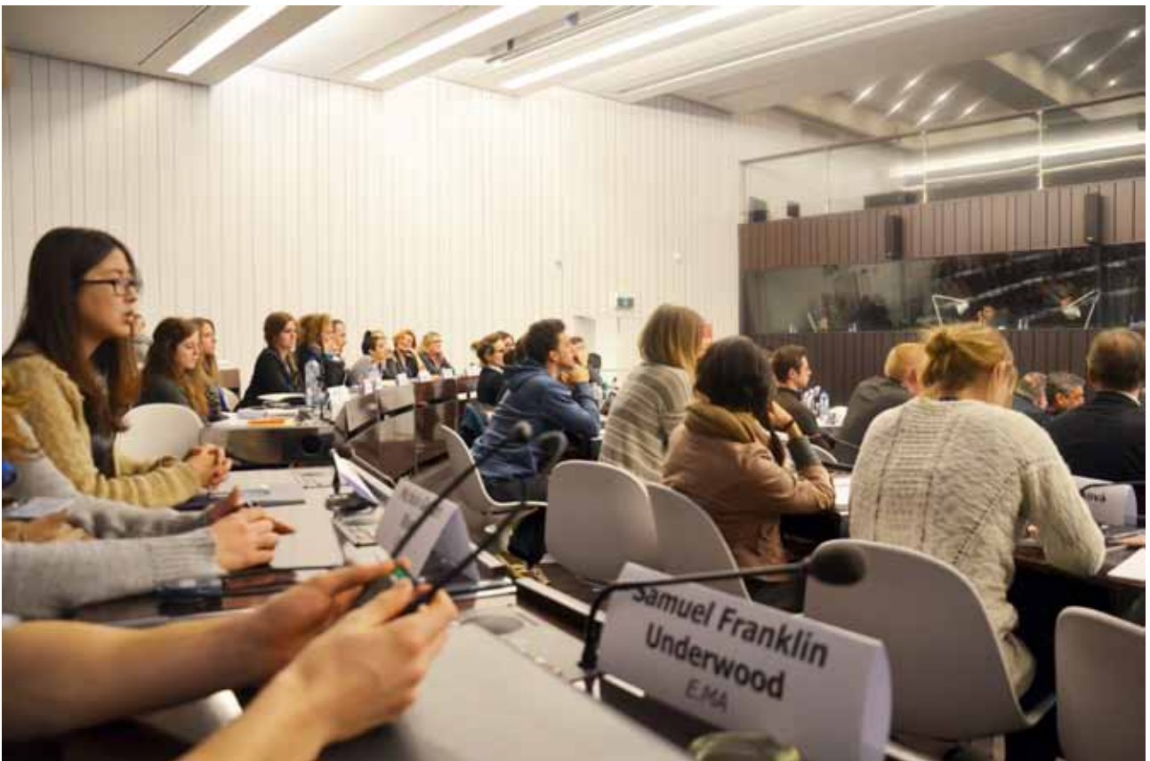
EMA Students visiting the European Commission (DEVCO) in Brussels, 2014