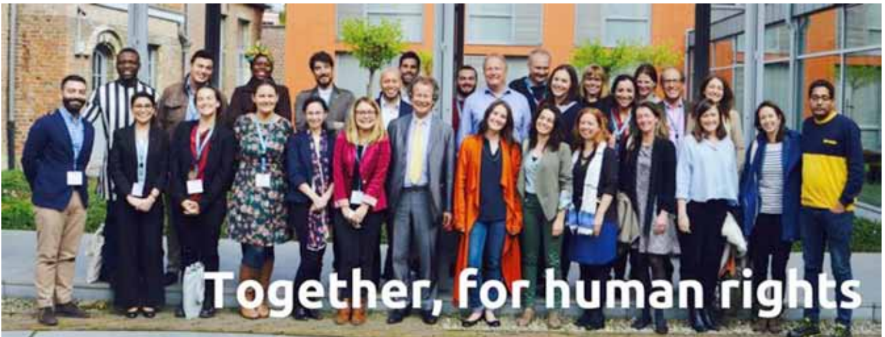
GCA Alumni at the 2017 AHRI-COST conference, Brussels "together for Human Rights"