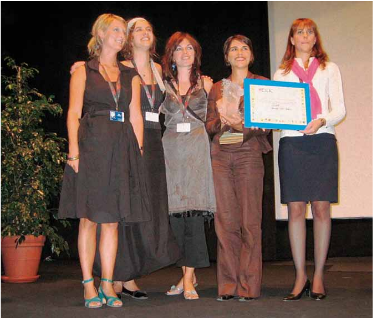
EMA Photo Competition Award, Venice International Film Festival, 2006