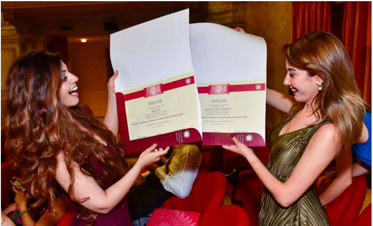
Arab Master Programme – graduates/diplomas – Graduation Ceremony 2016/2017, Auditorium Santa Margherita, Venice