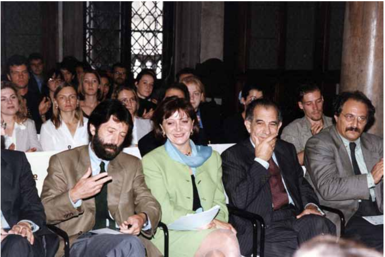
Massimo Cacciari, Mayor of the City of Venice (1993-2000) and Italian authorities, Venice – Palazzo Ducale (1998)