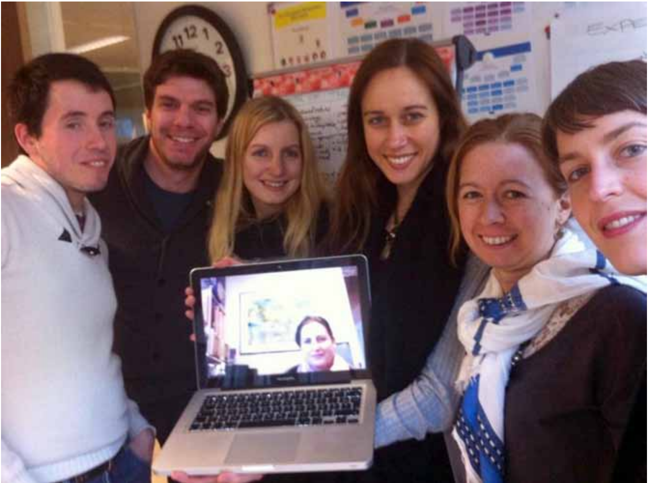
EMAlumni Association Board members, 2014-2016

launched in 2017. It features projects established by, and sometimes among, alumni and helps promote new connections and ideas.