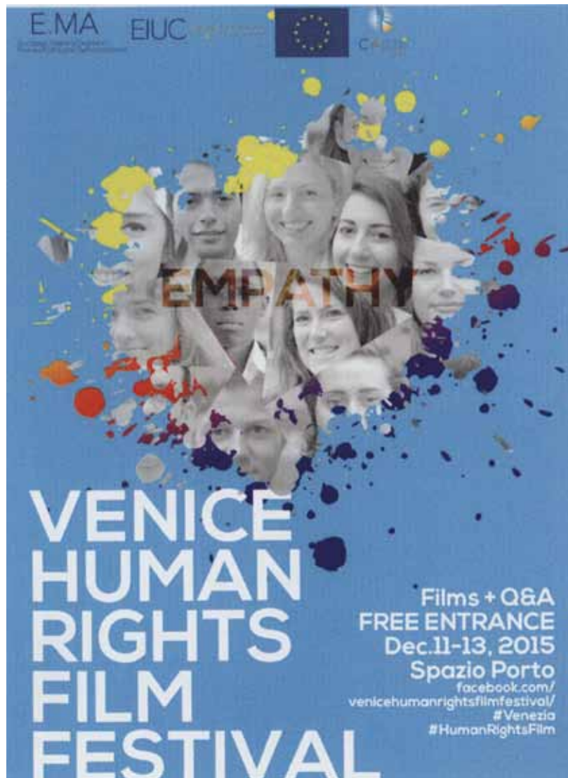
EMA Human Rights Festival "Empathy" 2015/2016