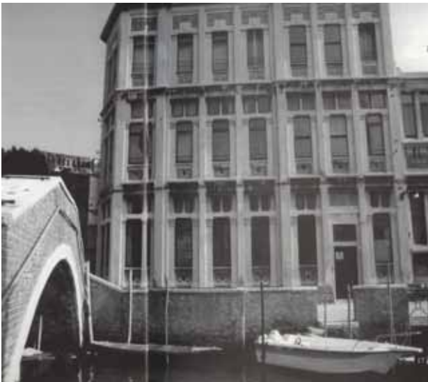
Scuola Palladio-Europa, Giudecca Island – First headquarters of EMA

From these considerations, and the common interest in human rights, came the idea to launch postgraduate courses on this subject that would be run by several universities from member states and open to both European and non-European graduates.