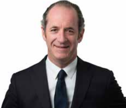
Luca Zaia, President of the Veneto Region

I also have a dream like Martin Luther King: respect for human rights and the democratisation in all countries of the world. There would be no more escape from the territories. Affected by conflicts, hunger and violence of all sorts and everyone could build in their future in the country of origin. Peace is realised through the respect for life and for the fundamental rights of human beings expressing their freedom of thought, conscience and religion. Democratisation is realised not with the imposition of force, but with the contribution of every single citizen, because democracy is not exported but it is built together. Every citizen should work in conscience and in full freedom for the fundamental and universal concept of peace, an ideal that belongs to all peoples and nations of the world. I say no to violence in any way it manifests. No to violence against children, women, disabled persons, and no always to inhumanity.