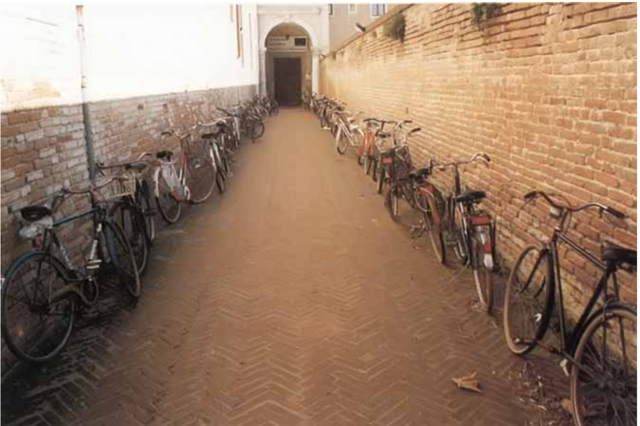
Bikes, Monastery of San Nicolò, Venice-Lido