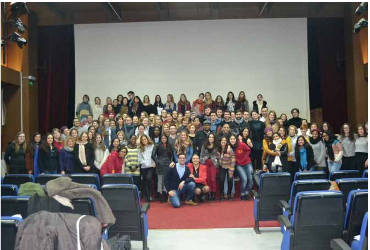
EMA Field Trip to Kosovo, 2014/2015 – Group photo