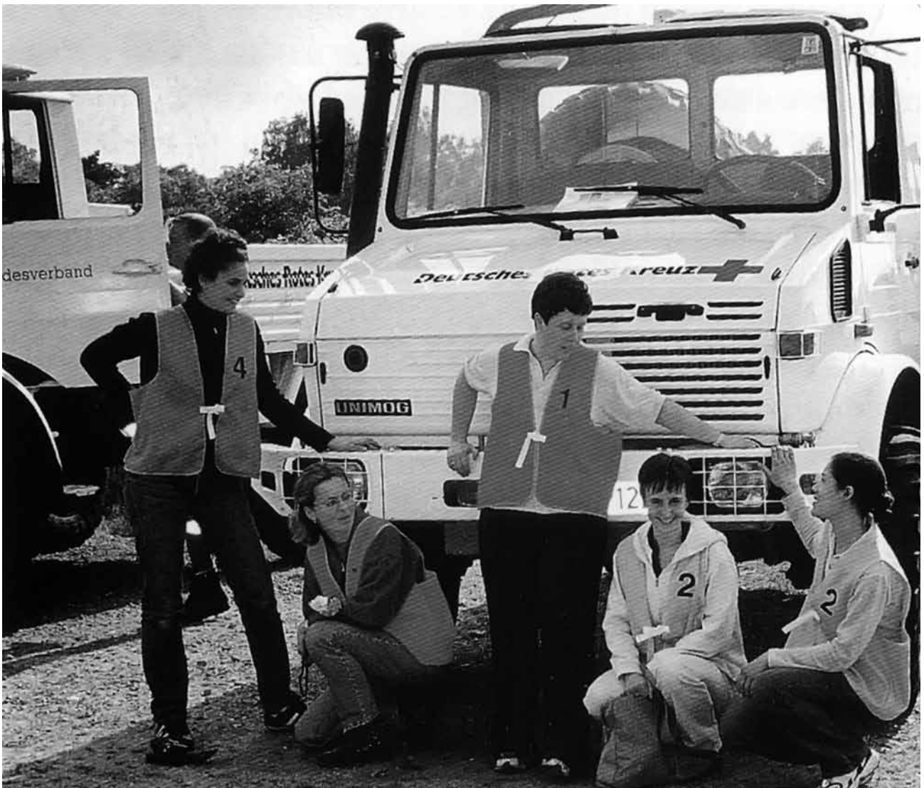
EMA student delegation in Ruhr-University Bochum – training with the Red Cross