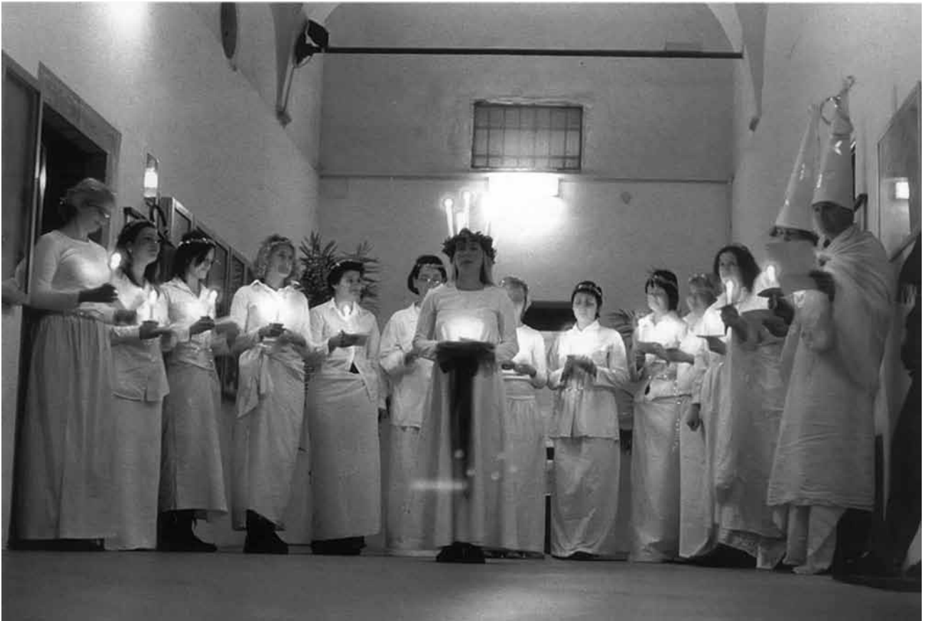
EMA procession – Santa Lucia celebrations 2003/2004