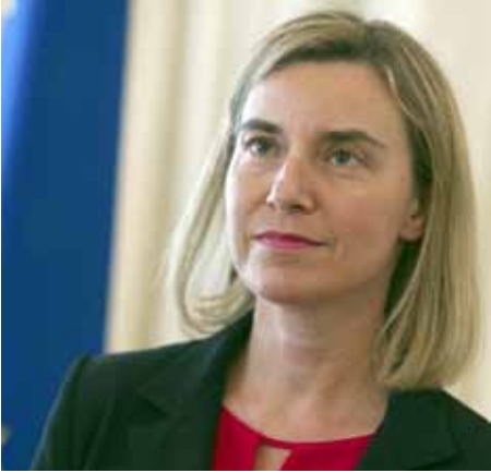
Federica Mogherini, High Representative of the European Union for Foreign Affairs and Security Policy and Vice-President of the European Commission

Human rights lie at the core of the European Union's foreign policy. Their promotion is not only a core value of our union, it is also consistent with our interests and necessary for our security. Human rights abuses only make societies less resilient and weaken