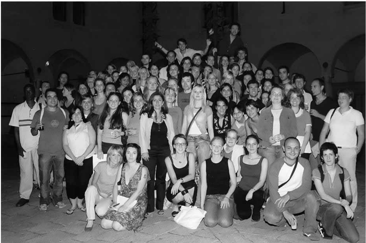
EMA students 2005/2006