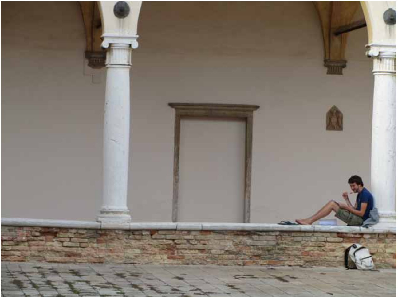
Studying in the cloister, Monastery of San Nicolò, Venice-Lido