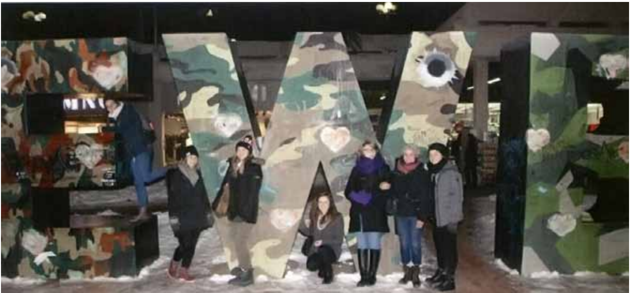
EMA Field Trip to Kosovo 2009/2010 – “new born” sign