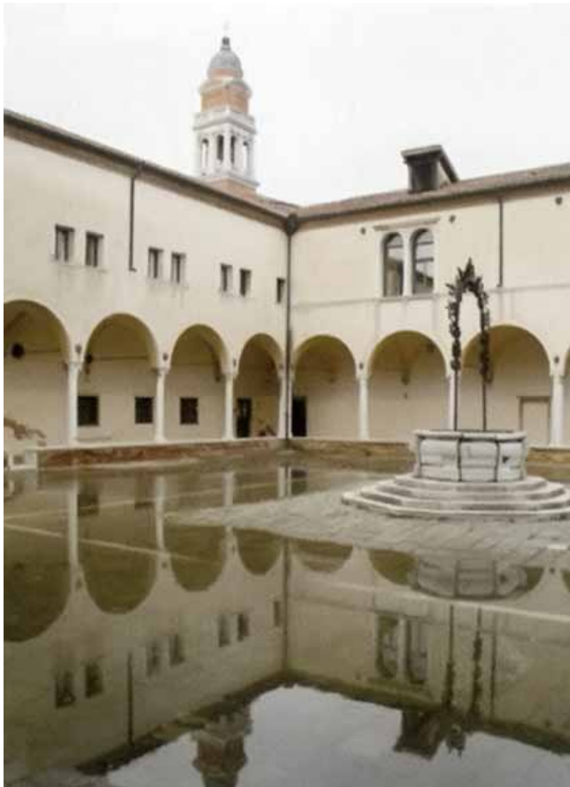
High water in the cloister of the Monastery of San Nicolò (EMA-EIUC seat), Venice-Lido