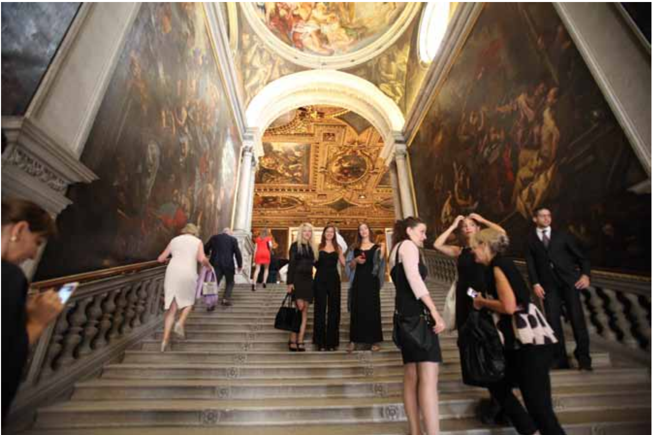
EMA Graduation 2014/2015, Scuola Grande di San Rocco, Venice