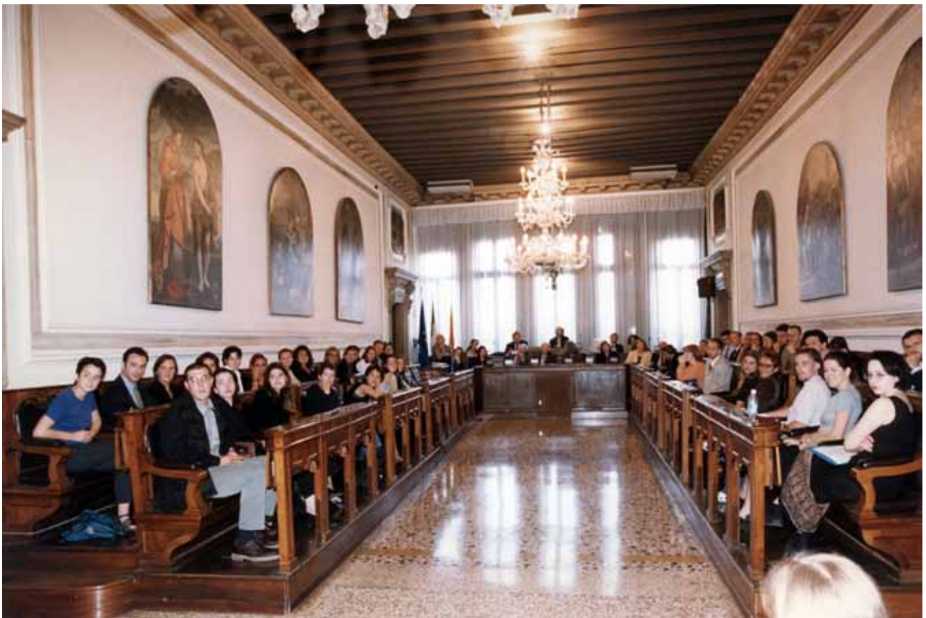
EMA students 1997/1998 – Venice – Palazzo Franchetti – City Council