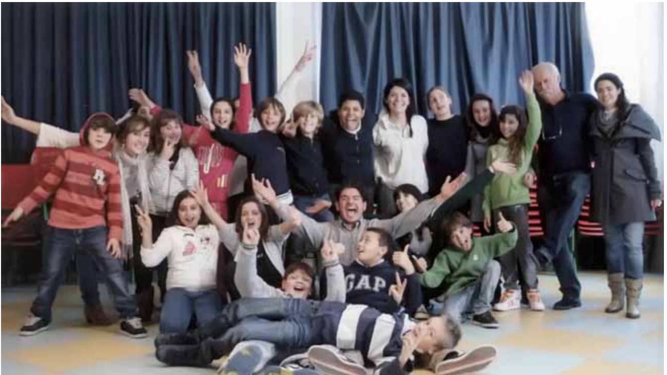
EMA students' workshops in Venice-Lido Elementary School, 2011/2012