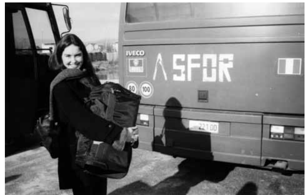
EMA field trip to Bosnia and Herzegovina, 1998/1999

possible human rights violations that may occur if the so-called 'Algerian Six' were to be handed over to the US by his government. This was a challenging conversation, especially given the fact that the students later learned that the prisoners were released by the Lagumdza government, only to be re-arrested, literally on the opposite side of the street by US forces. It was clear that this created a deep sense of disillusionment in the students. The feeling took on new significance when students also learned that the six men were not only re-arrested but also transferred to Guantanamo Bay. It was later discovered that they were subjected to years of torture, despite their innocence. Some were eventually released and only allowed to return to their families in Sarajevo due to the efforts and support of people from the human rights family.