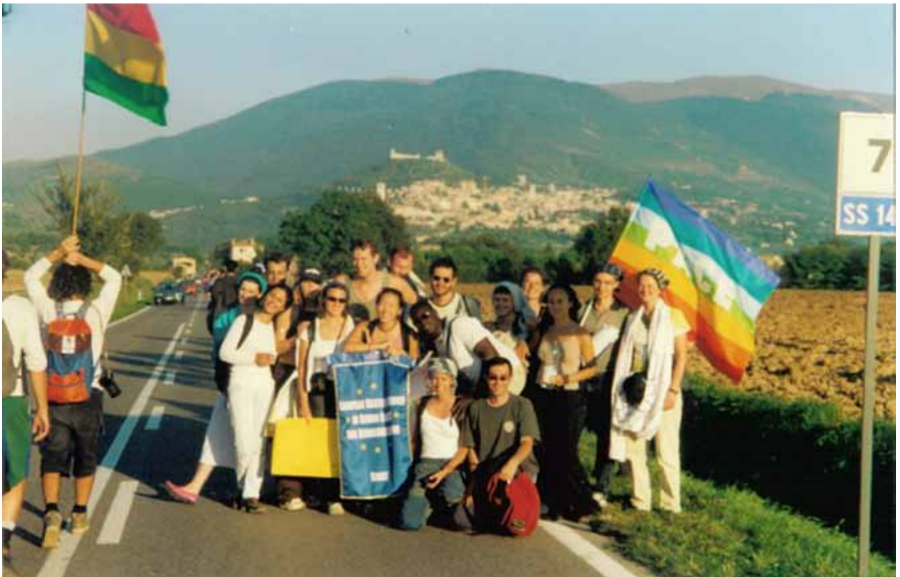
EMA students at Perugia-Assisi Peace March