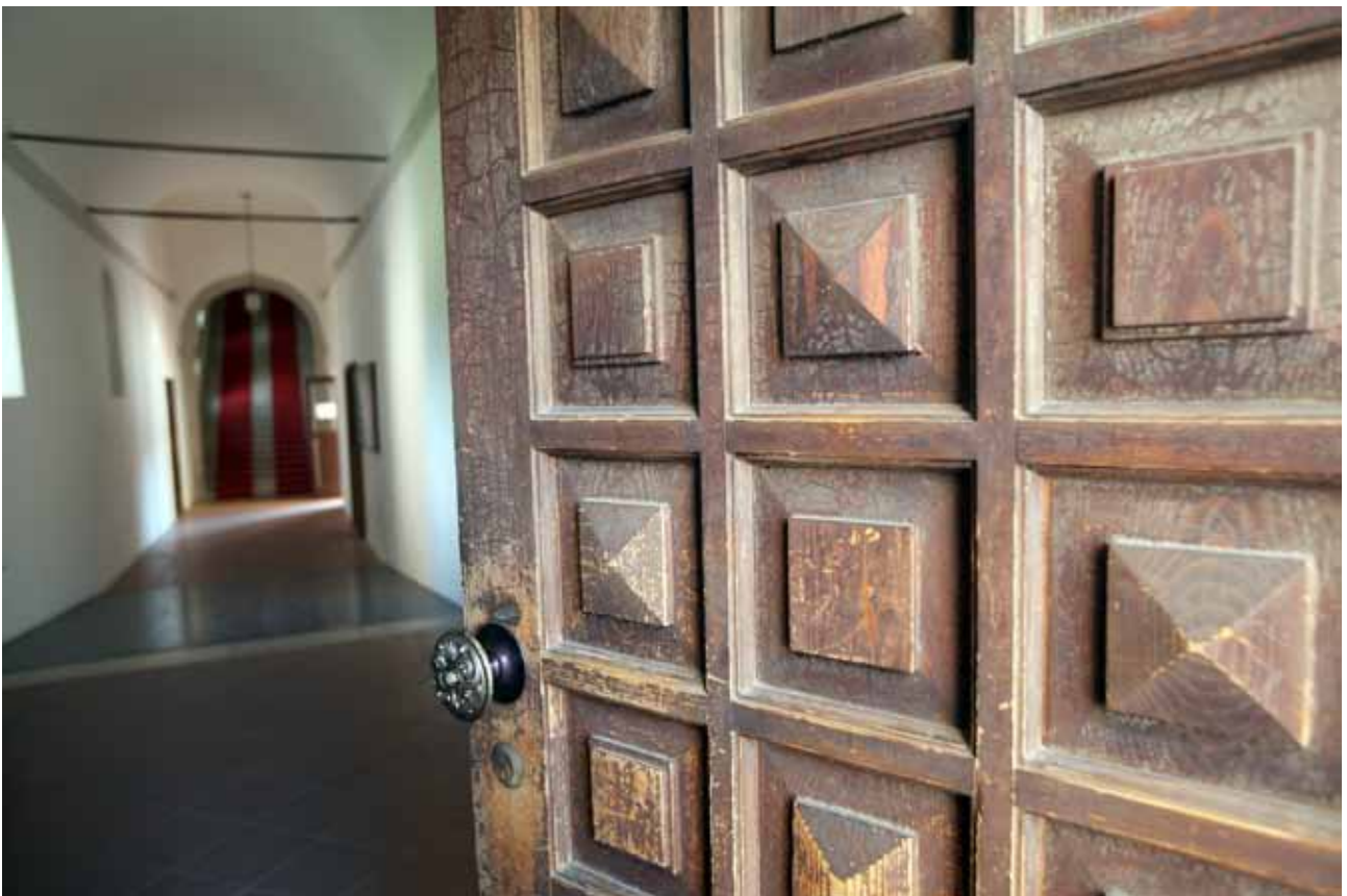
Entrance door – Monastery of San Nicolò, Venice-Lido