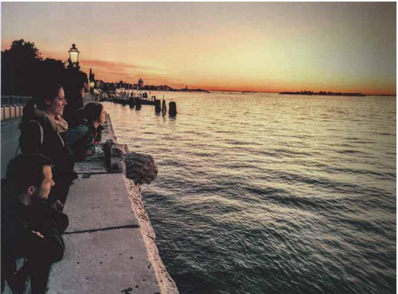
EMA students 2012/2013 – sunset watching from the San Nicolò bridge