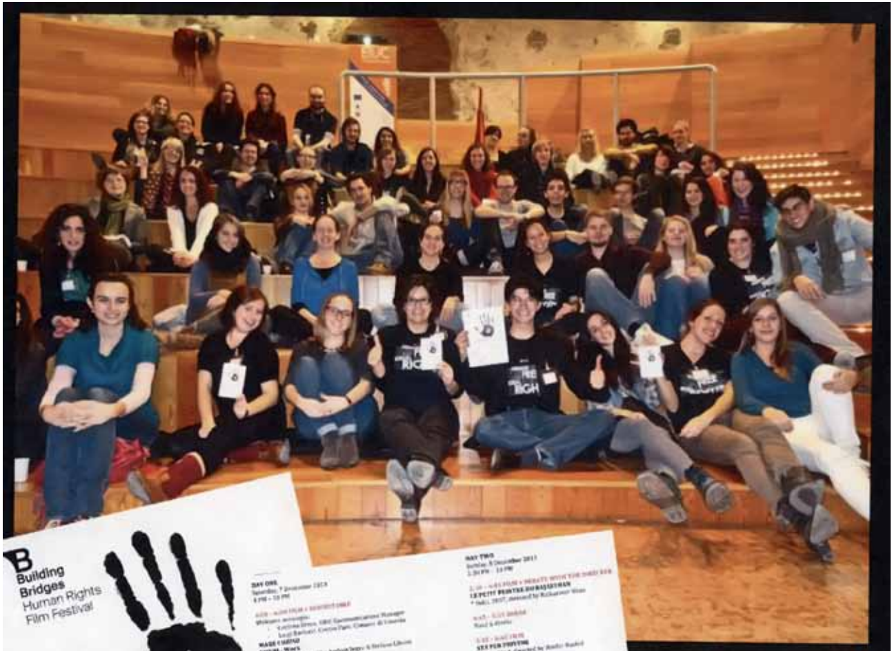
EMA Film Festival "Building Bridges" – 2013/2014