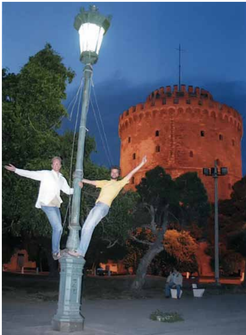
EMA second semester in Thessaloniki, 2006/2007