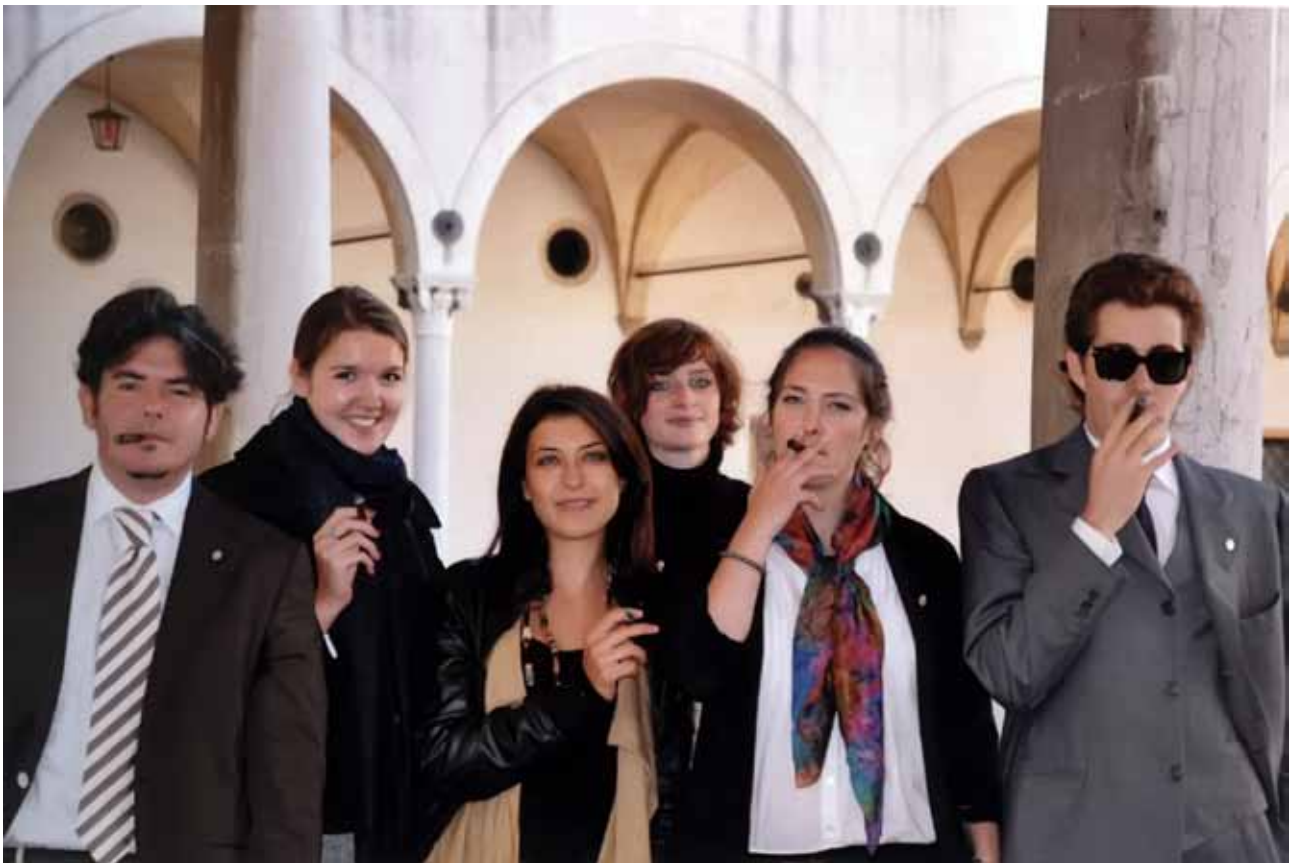
EMA Students' Cigar Club, 2011/2012