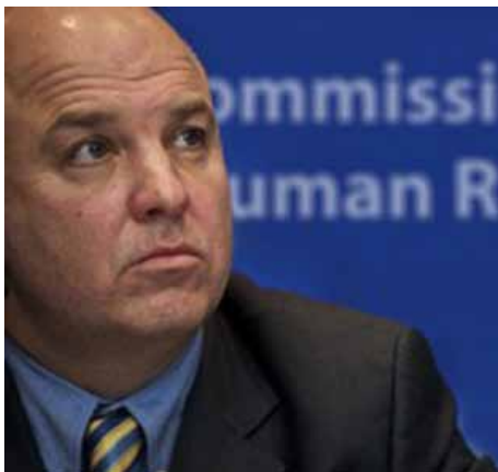
Nils Muiznieks, Council of Europe's Commissioner for Human Rights

Over the past 20 years the European Master's Degree in Human Rights and Democratisation has provided an invaluable contribution to human rights education across Europe. By preparing young professionals for their future work in international organisations, NGOs, national authorities and other settings, the Master's stands out as a high-level product of European cooperation. I salute the engagement of the teaching staff and I hope more and more students will decide to follow this Master's and apply the knowledge it provides