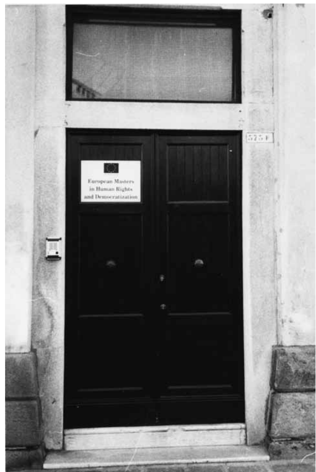
Scuola Palladio-Europa, Giudecca Island – First headquarters of EMA

Their commitment during the courses and, later, the quality of their work in international organisations and NGOs, universities and in the ministries of the member states and delegations, constitute the most important testimonials of EMA's credibility.