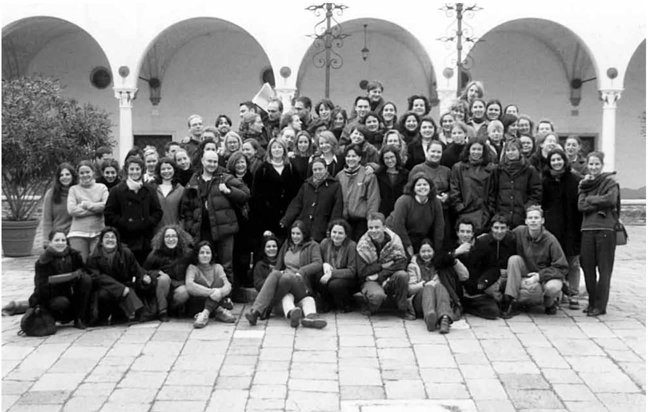
EMA class 1999/2000