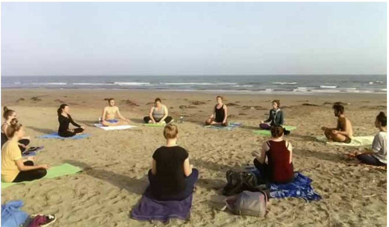
EMA students – Yoga at the Beach