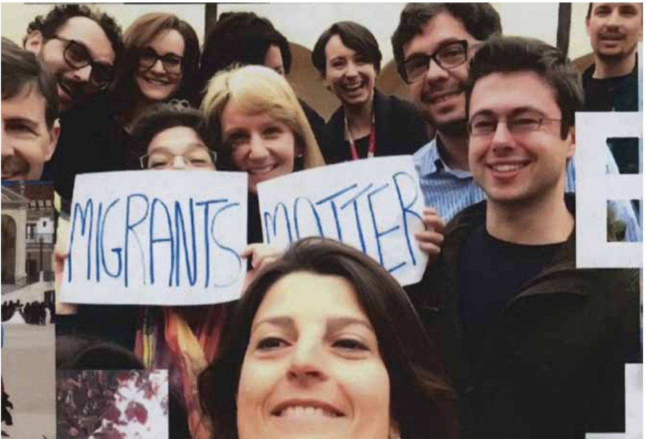
Migrants Matter EMA campaigning with EIUC staff