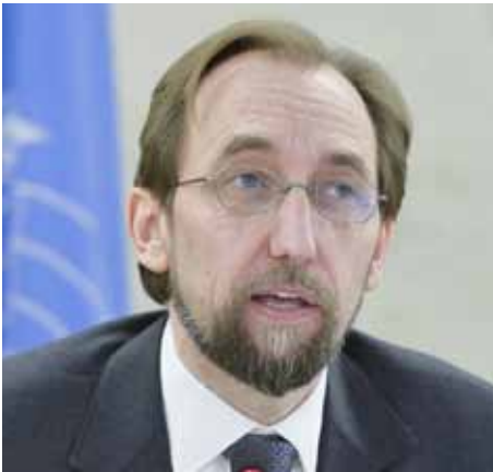
Zeid Ra'ad Al Hussein, United Nations High Commissioner for Human Rights and Democratisation

Human Rights Education is vital for promoting inclusion and participation, sustaining social cohesion and preventing violence and conflict in our societies. To this end, higher education institutions have the social responsibility not only to educate ethical citizens committed to the construction of peace and the defence of human rights, but also generate global knowledge enabling us to address current world challenges with human rights-based solutions.