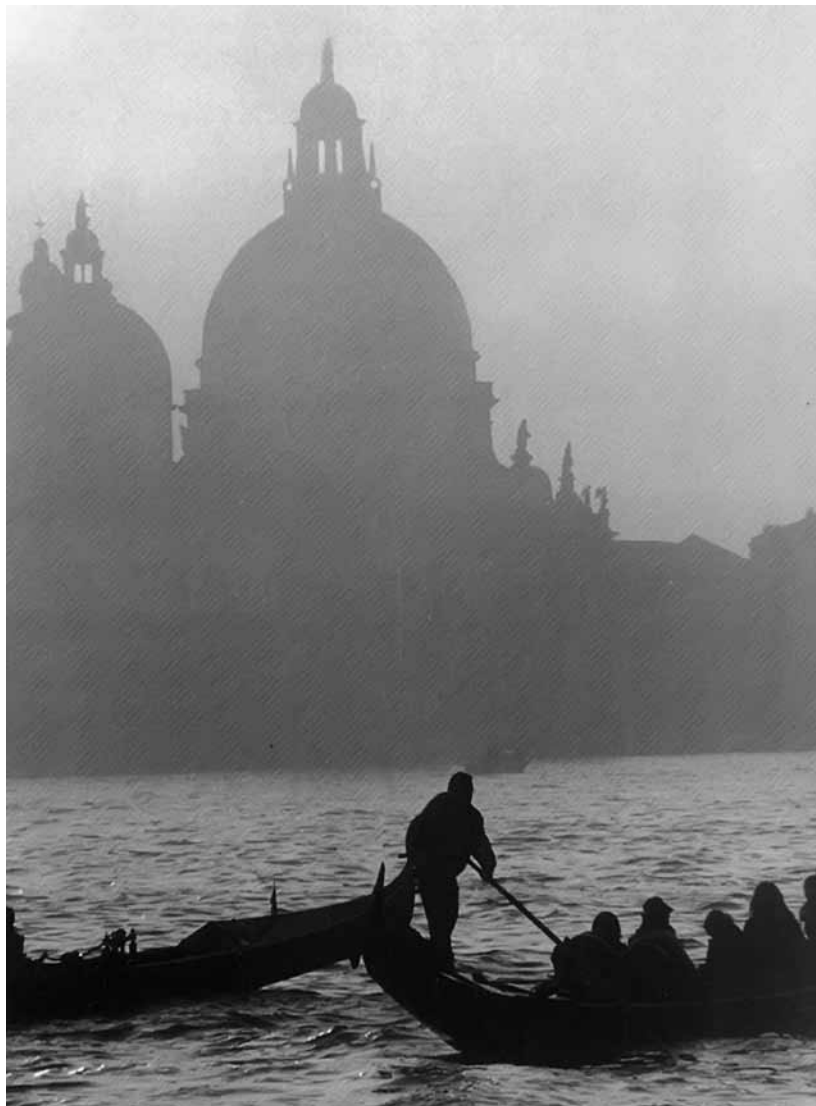
Venice, Canal Grande – Basilica della Salute