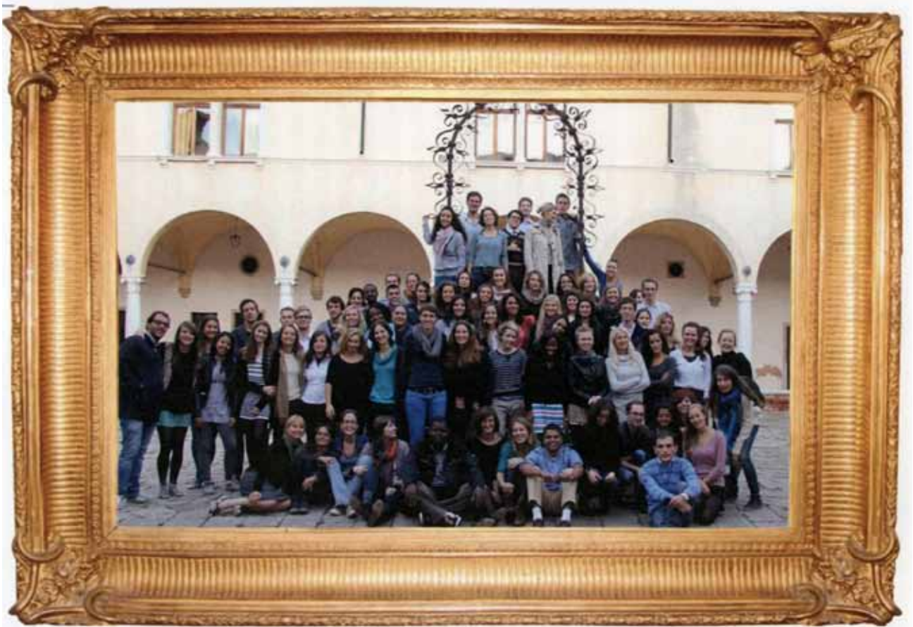
EMA students 2012/2013