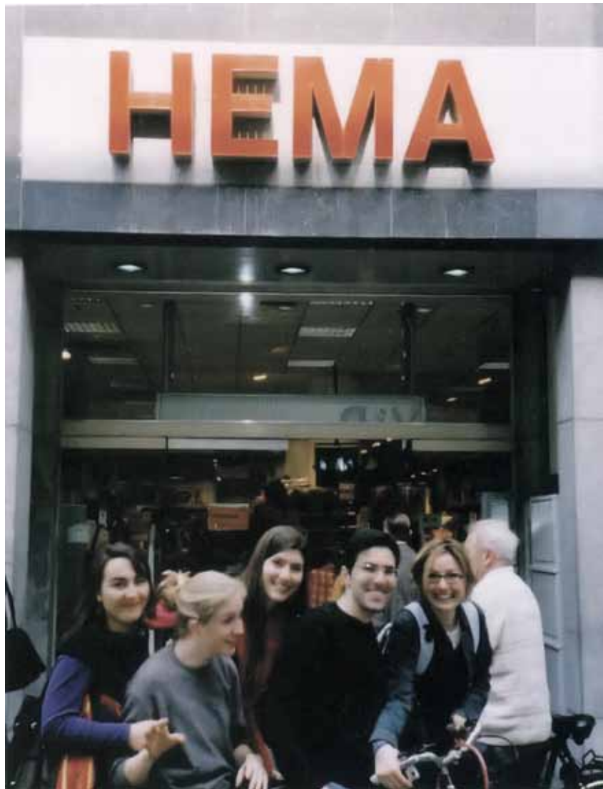
HEMA, EMA students, 2004/2005