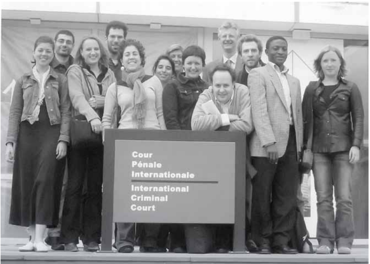
EMA students 2002/2003 – study visit to the International Criminal Court (ICC)