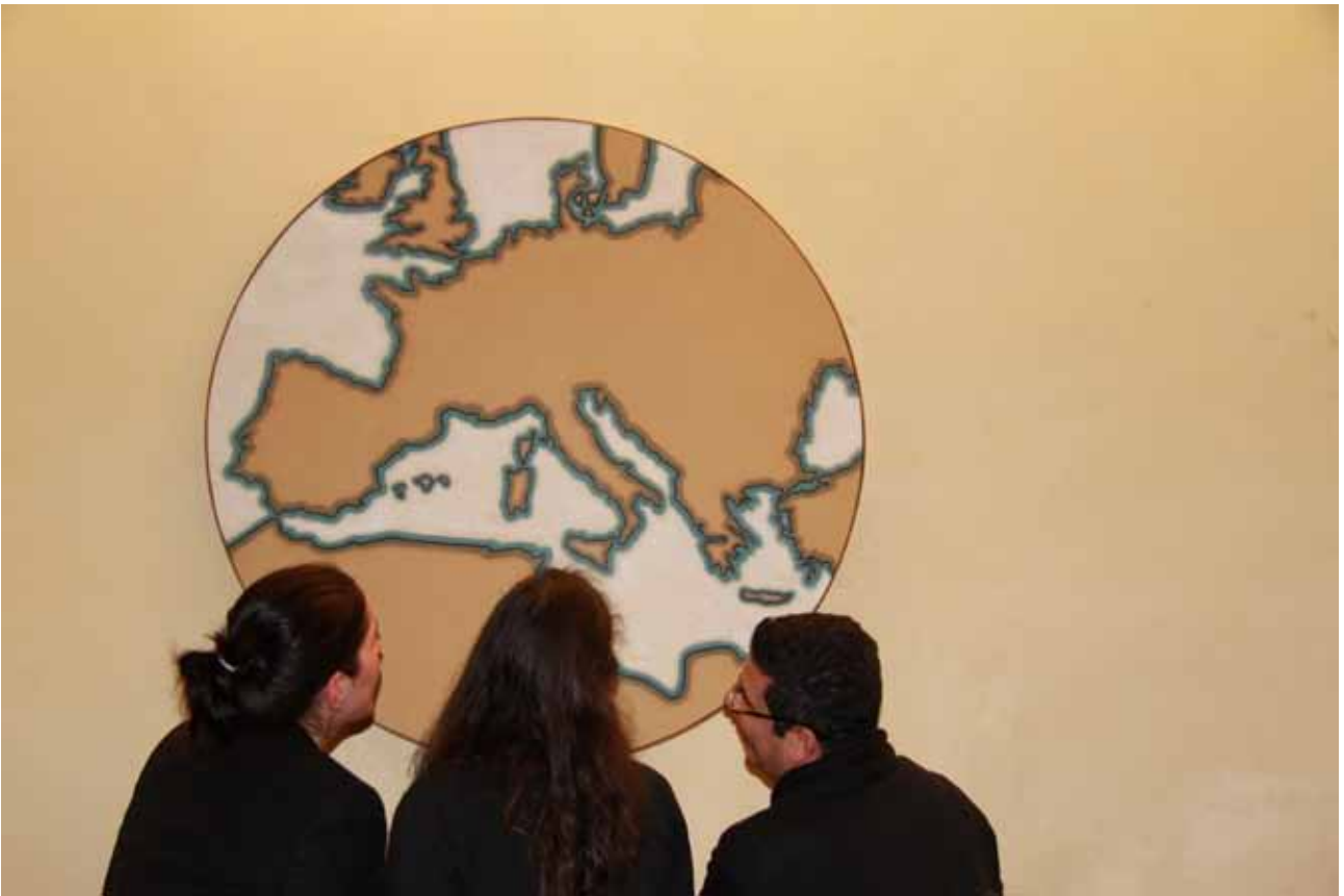
EMA Alumni Map, Nicelli Airport – Venice-Lido