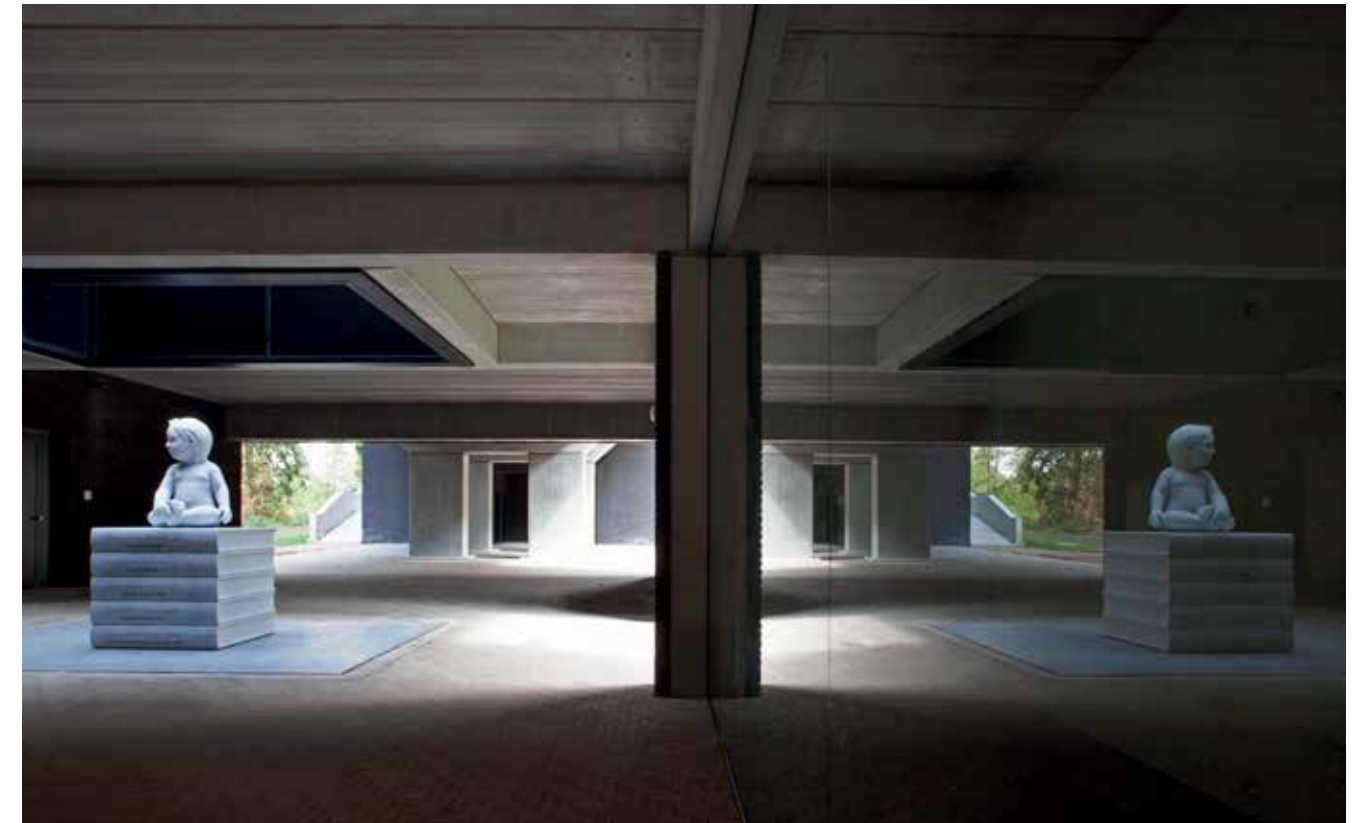
Collective Memory, marble sculpture underneath the Battery - Studio Koen Vanmechelen, LABIOMISTA, Genk (BE)

“In that context, we should situate my initiative to create the evolving artwork The Human Rights Pavilion. With the Human Rights Pavilion, I want to explore with others the complexities of human nature, the possibility of a universal concept of human rights and the role of art in its development. I firmly believe that in the Anthropocene, the era in which the human impact on the Earth’s geology and ecosystems reaches critical proportions, art can help in the development of this much needed new universal concept of human rights, taking into account local sensibilities. Connecting the universal with the local and making human rights not or less controversial.”