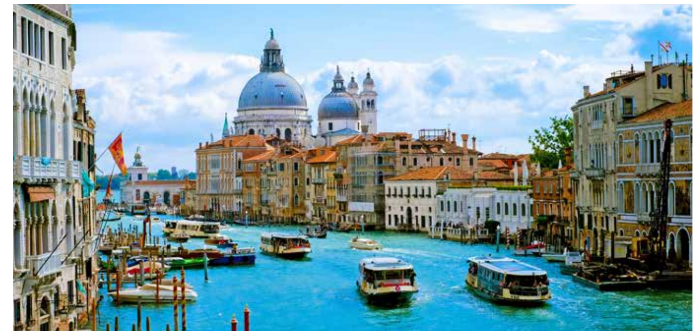
Beautiful view of Grand Canal and Basilica Santa Maria della Salute in Venice