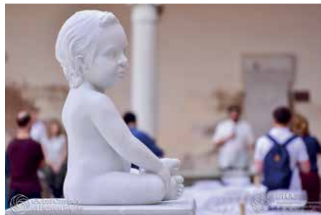
Collective Memory, Global Campus of Human Rights, Venice (IT), 2017 © Koen Vanmechelen, Photo Global Campus of Human Rights

At the initiation of the Human Rights Pavilion, Vanmechelen also presented a new body of work, dedicated to the concept of Human Rights. COLLECTIVE MEMORY consists of Encyclopedias of Human Rights, combined with