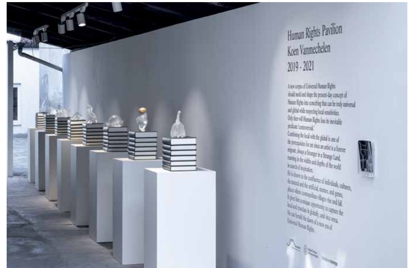
Collective Memory, Human Rights Pavilion, GLASSTRESS, Venice (IT), 2019